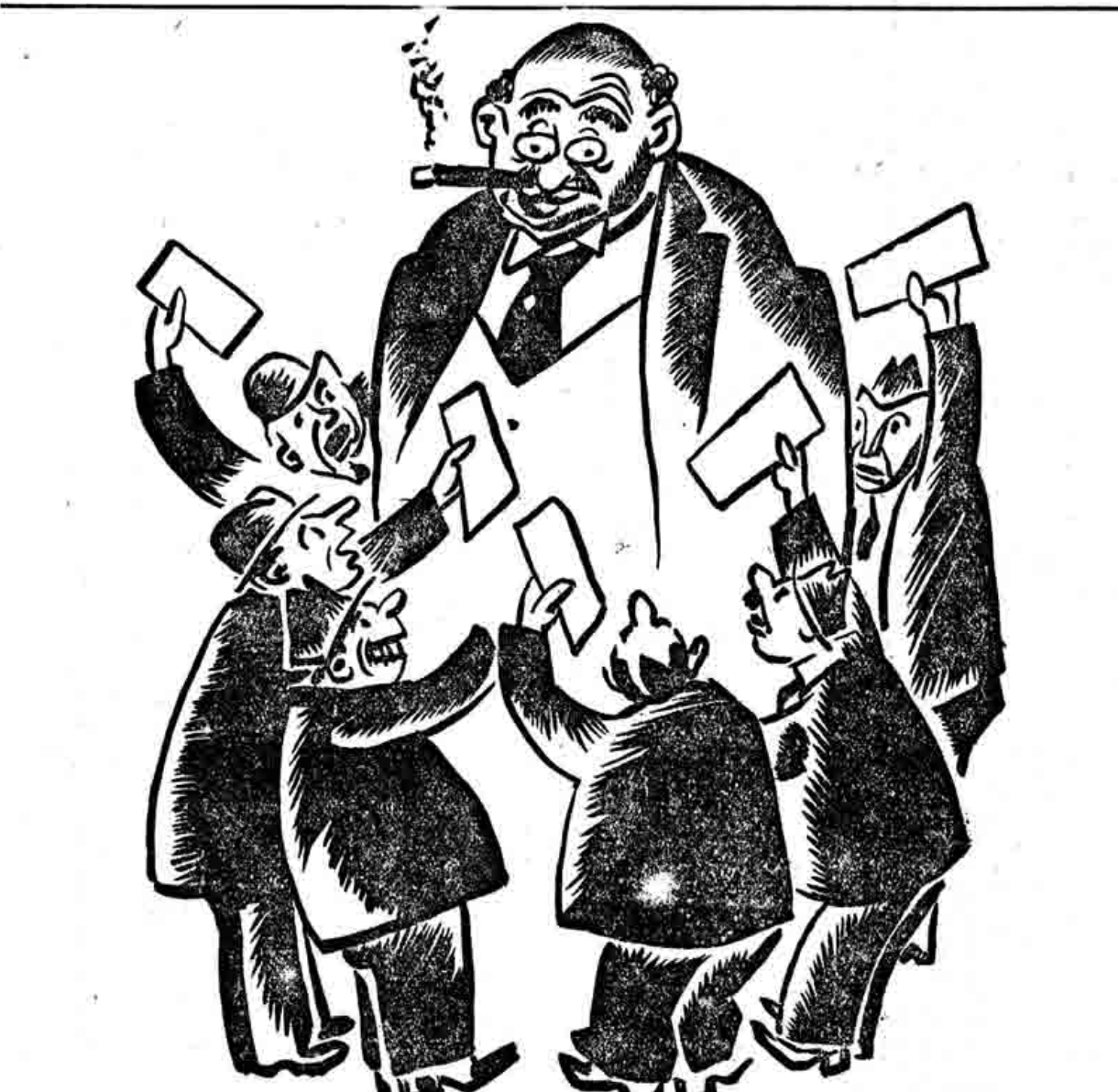
Labor Fakirs Want Workers to Back Them So They Can Live Easy Peddling Insurance to the Bosses.