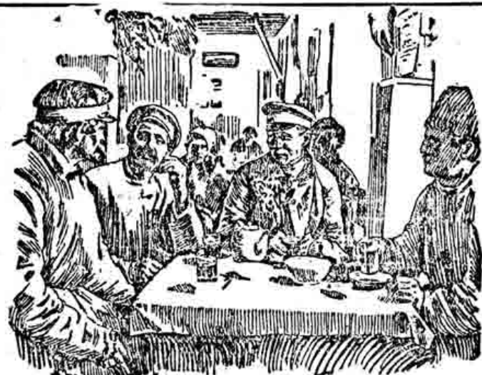
Before prohibition the workers of Russia had no organizations of any amount. Now, besides the Communist Party, they have many trade union, educational, recreational and other organizations. Here one of their club rooms is shown.

on hooch are the strongest supporters of the sort of prohibition enforcement we have now, and which is sponsored almost exclusively by the anti-saloon league.