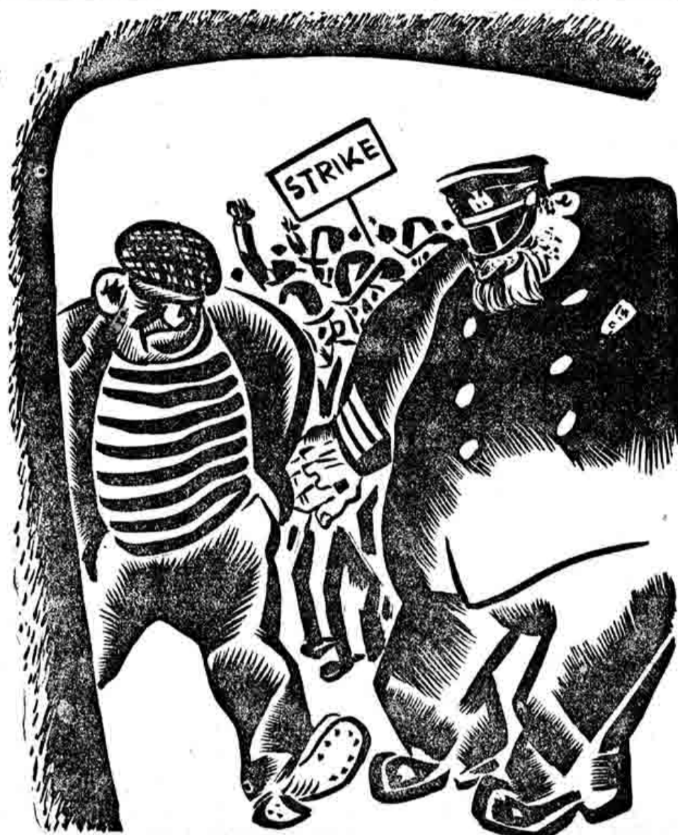
Why You Little Shrimp! Ya Better Say the Boss Is Alright or I'll Bust Ya in the Nose!