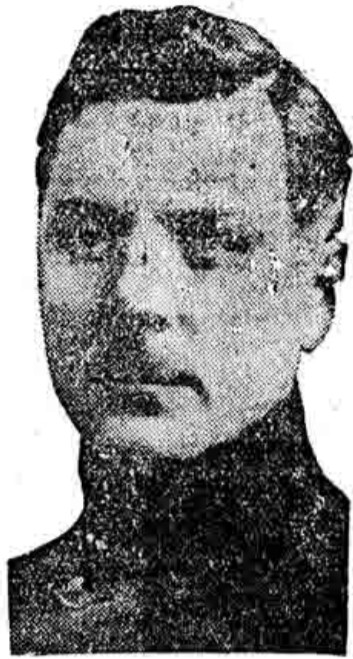
COMMISSAR OF WAR VOROSHILOFF

"The power of the working class organization. Without organization of the masses, the proletariat is nothing. Organized—it is all. Organization is unanimity of action, unanimity of practical activities."