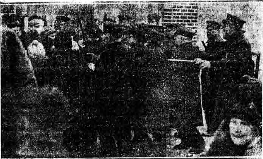
Brutal Assault on Women and Children by Police of Clifton, N. J.