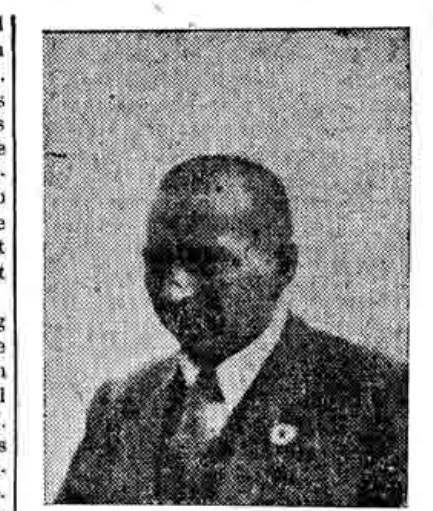
TOMSKY Head of the Russian Trade Unions

Tomsky pointed to the increasing number of cases of larceny in the shops' councils and declared that this form of crime must be fought not only by firm judicial measures, but also by the introduction of better forms of reckoning up between the shop councils and their electors. Communist trade unionists should account for themselves not only to the Communist fractions, but also as far as possible to all non-party elections. The collective agreements should not be merely worked out, but all of the workers interested should be previous-