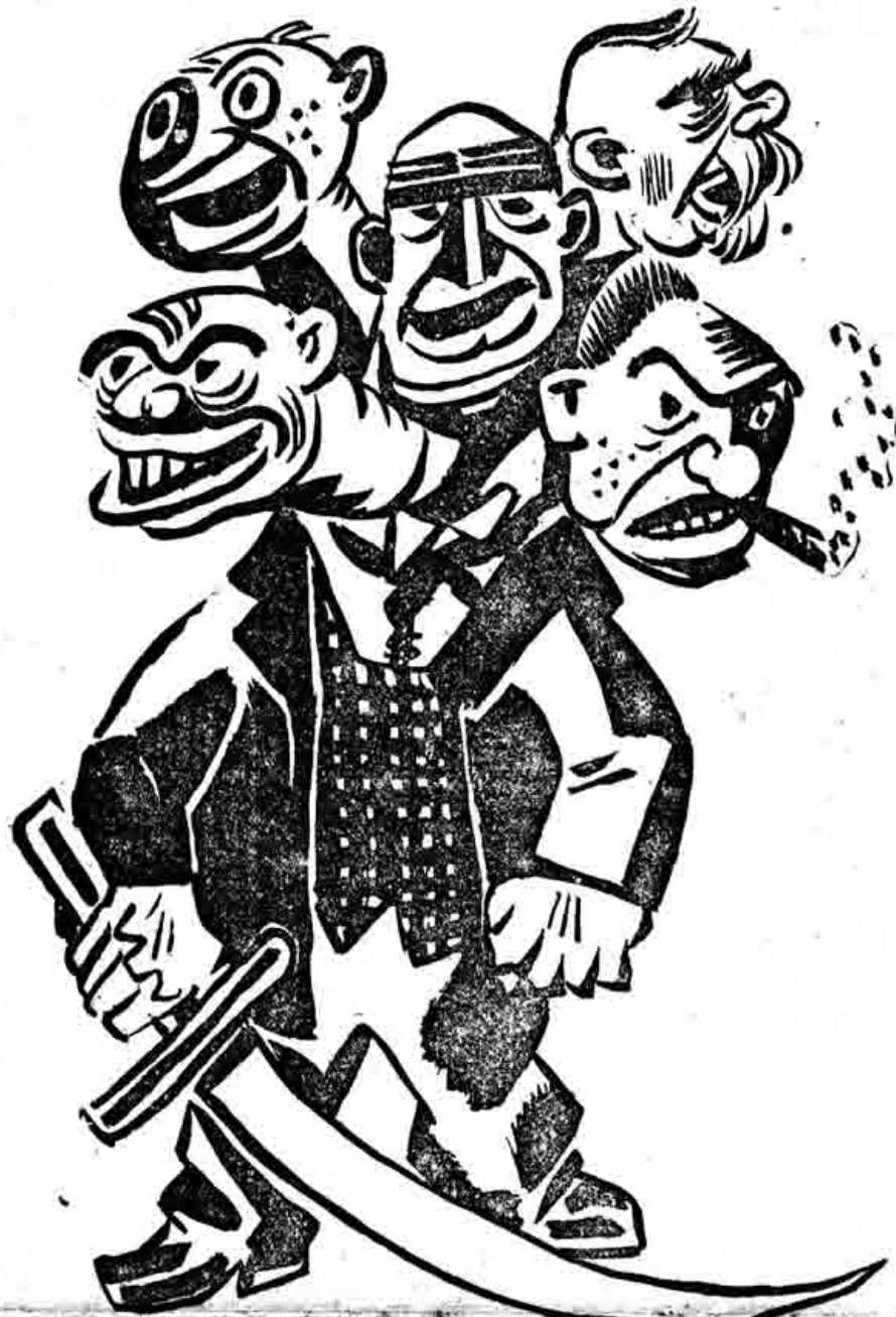
The Trusts Unite Into Super-Trusts and the Banks Into Money Monopolies.