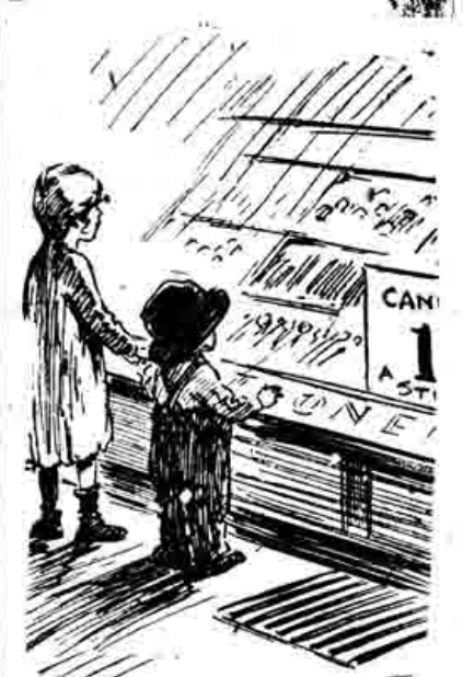
"SHOPPING" your part? Did you answer the questionnaire of the sub-committee for Jewish work? If not, why? Don't you know that by neglecting your duties you retard the work of the national office? If you have some information on the problem of the Jewish speaking working youth, send same to the national office and for publication in the paper.

The Jewish work must be pushed forward. With the reorganization the task of reaching the young worker on every field where he is found must be intensified. Our agitation and propaganda must be carried on in all places where the working youth is found, the shops, trade unions, clubs and other youth organizations.