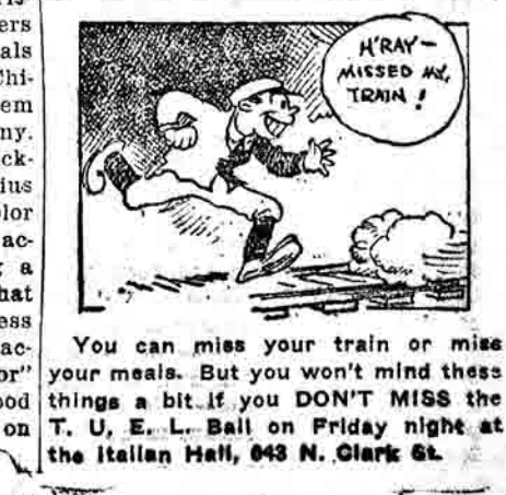
You can miss your train or miss your meals. But you won't mind these things a bit if you DON'T MISS the T. U. E. L. Ball on Friday night at the Italian Hall, 643 N. Clark St.

Every Worker should read The American Worker Correspondent.