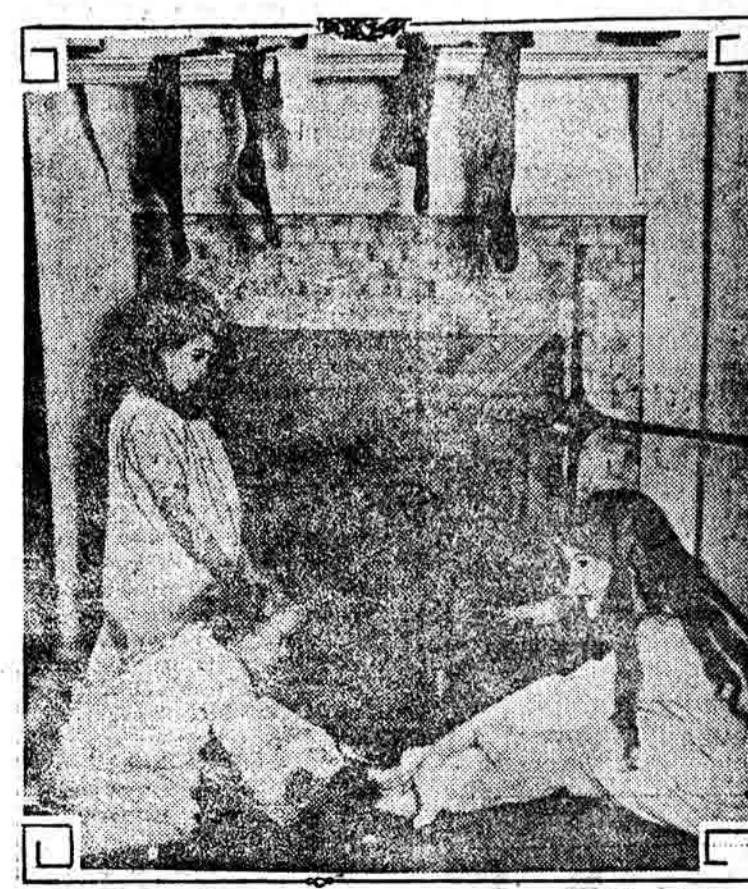
Children of the sharers in the profits of labor find the illusion of Christmas a cause for happiness because it means a full stocking.