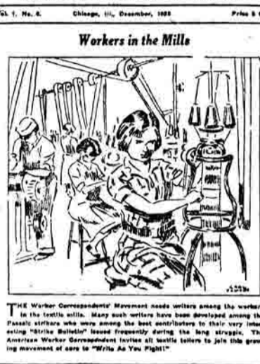
The American Worker Correspondent Movement needs writers among the workers in the textile mills. Write and we will send you more information about the movement. Send your name and address to: American Worker Correspondent, 1113 W. Washington Blvd., Chicago, Ill.

er worker writers in this movement and to struggle valiantly against all its weaknesses."