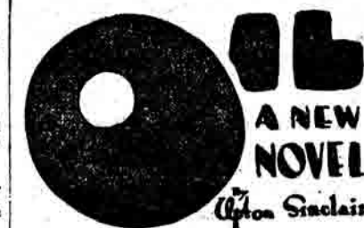
(Copyright, 1926, by Upton Sinclair)

The great man sat at his flat mahogany desk, as clear of papers as the prevailing superstition required. It appeared as if a captain of industry had not a thing to do but grin at a college boy, and gossip about the boy's mistress and his own. But when Bunny remarked, "Mr. Roscoe, I came to see you here because I want to talk to you about the new wage scale." And in a flash the smile went off the magnate's face, and it seemed as if even the fat went off his jaws. If you have thought of him as a mixture of geniality and buffoonery, this is the time for you to set yourself straight, along with Bunny, and all other rebels against the American system.