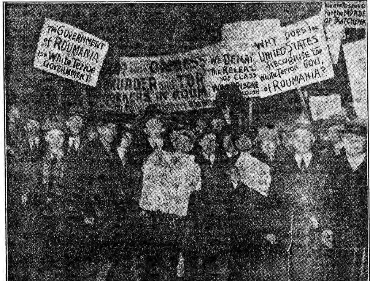
Here is a belated but none the less interesting picture of how workers of Chicago greeted Queen Marie. It shows a small section of the crowd that gathered before City Hall after the demonstration at the depot. The photographer pulled his flashlight just two seconds before the police phalanx charged the crowd.

The latest raid was on the barracks at Crumlin, a town three miles from here.