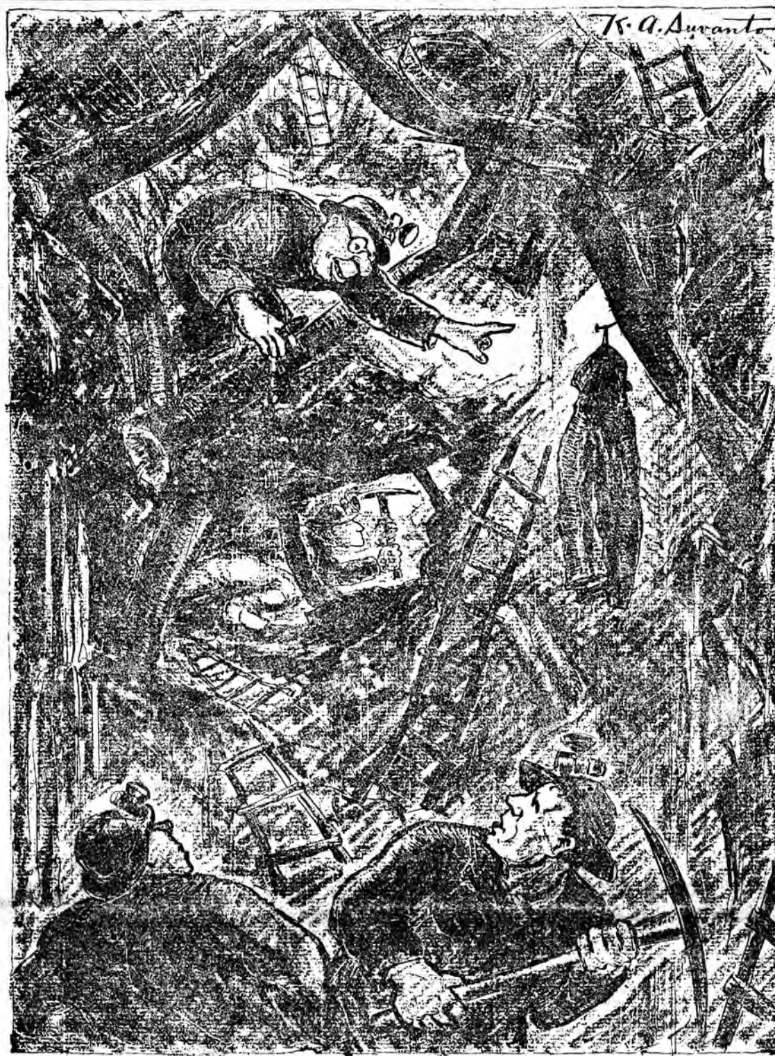
Mine Inspector: "Well, this mine seems to be quite safe in every respect, if you just wrap some cotton on the head of that nail, so that no one will hurt their head on it."