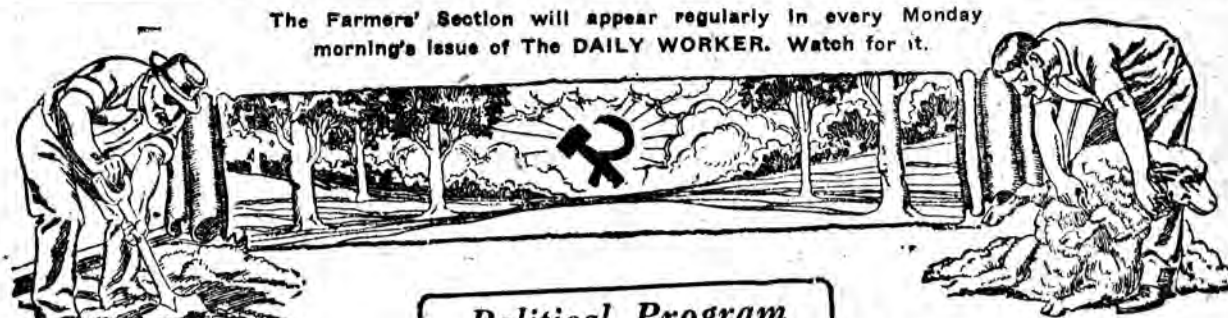
The Farmers' Section will appear regularly in every Monday morning's issue of The DAILY WORKER. Watch for it.

MOSCOW, Nov. 7.—The Gostrog (State Trade Administration) has finished its task of purchasing agricultural machines abroad for the U. S. S. R. in 1925-26 operative year. More than half of the machines were bought in America. Tractors have been purchased for the sum of over eight million rubles. The conditions of credit abroad were quite acceptable and satisfactory.