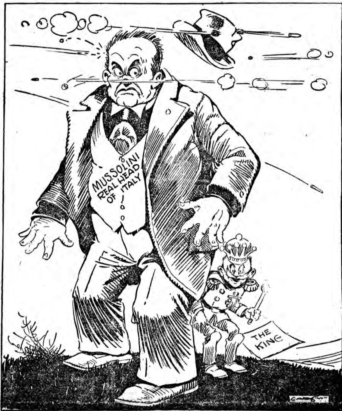
The fatal regularity with which Mussolini has been missed by crack pistol shots and past masters in the art of bombing, while causing some suspicion in the minds of skeptics has only now been revealed as well calculated bogus attempts engineered by the fascist themselves for the purpose of whipping up national sentiment and enhancing the prestige of the head fascist.