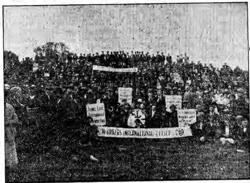
Thousands of British miners are receiving help collected from the world's workers by the Workers' International Relief of which the International Workers' Aid in the American Section. Send your contribution to the I. W. A., 1553 W. Madison St., Chicago.