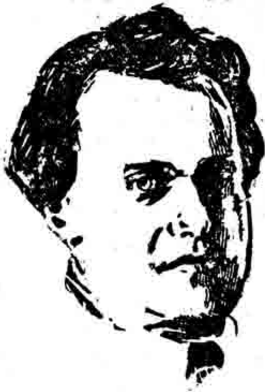
COMRADE KIBISCHEV Chairman Central Control Committee of the All-Union Communist Party.

When Comrade Krupskaya as a member of the central commission signed the so-called "platform of the four," the president of the central control commission considered it necessary to address a letter to the central committee in which the presidium declares its agreement with the majority of the central committee and expresses the opinion that the discussion of these questions was inadmissible.