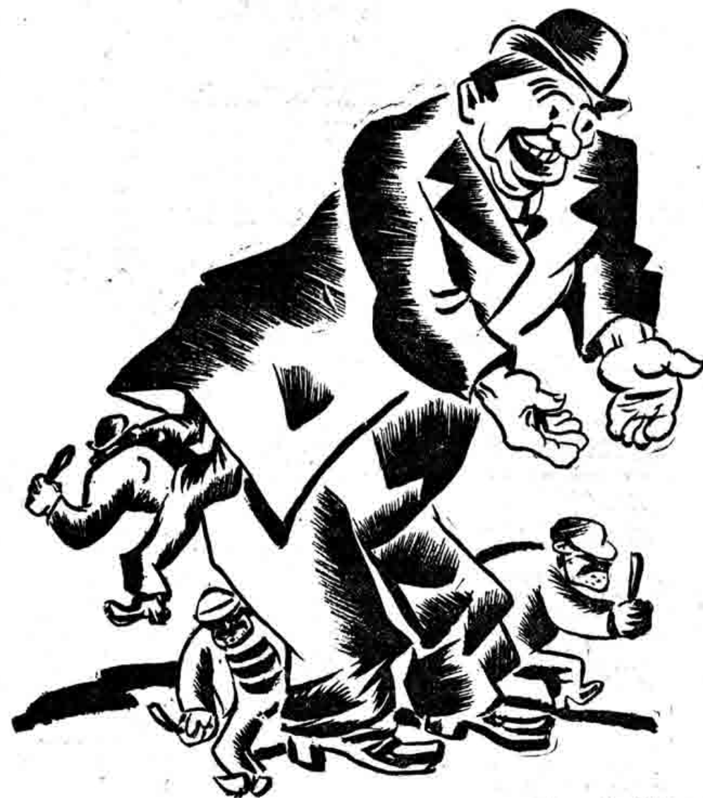
His Mouth Speaks of Peace—His Pockets Pour Out Gangsters. Drawn by William Gropper.