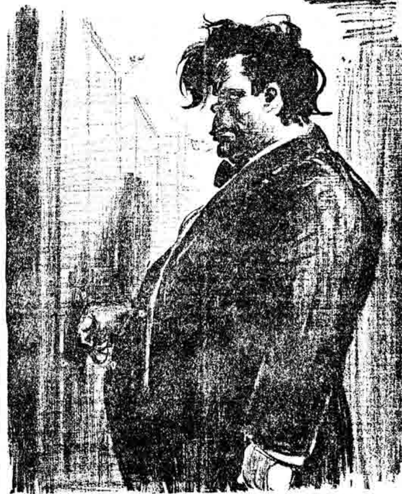
SENATOR WILLIAM E. BORAH.

and described him "as clean as a hound's tooth." Willis, one of the luminaries of the Coolidge camp said on the floor of the senate: