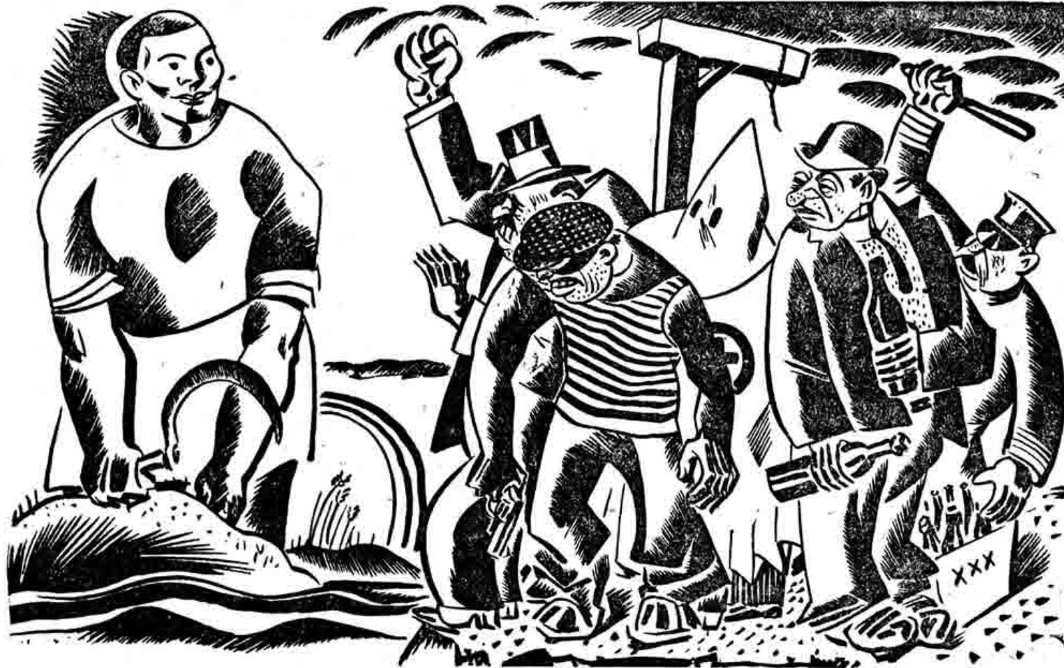
Drawn by William Gropper.

This Is the 'America' Which Refuses to Recognize Him