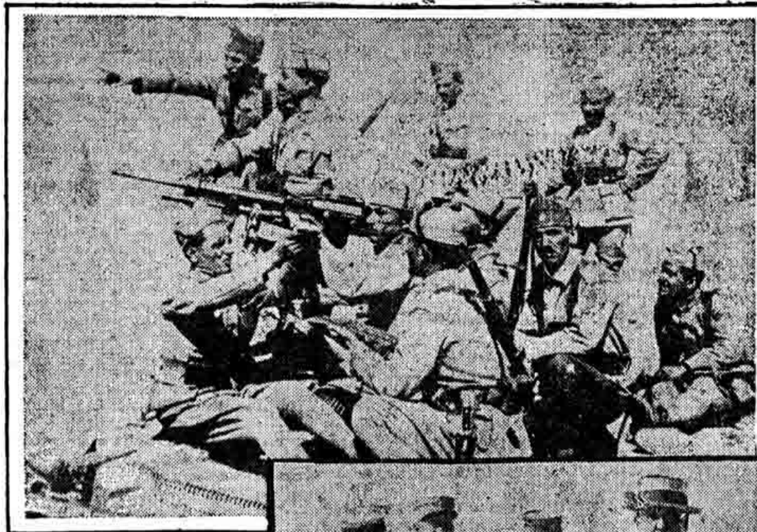
At the right is a picture of former Premier Pangalos being landed at Athens following his arrest by the new dictator Condylis. Above is a machine-gun detachment of troops whose loyalty to this or that military chief depends on promises of higher-ups. The so-called "revolution" in Greece simply means that one fascist dictator has been substituted for another.