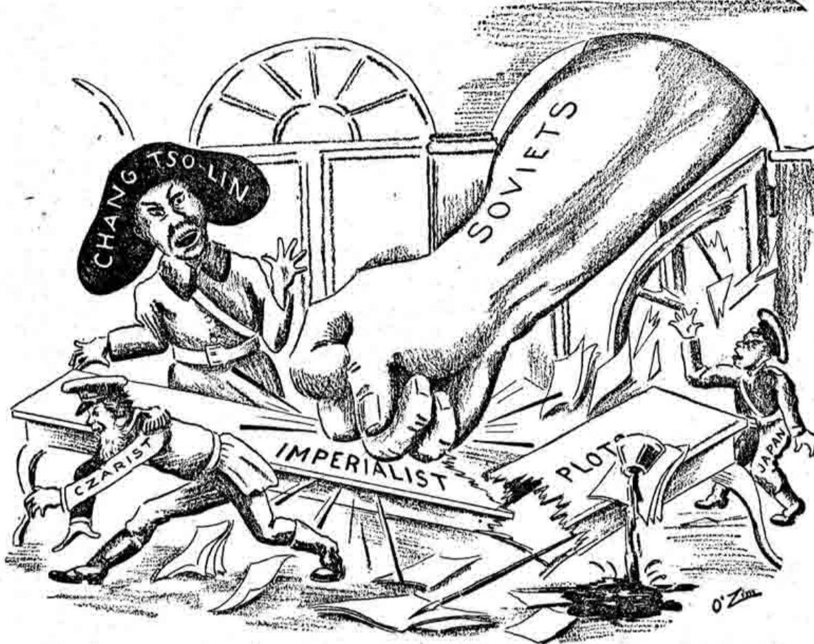
Chang Tso-Lin, Tool of Japanese and U. S. Imperialism, Won't Forget It.