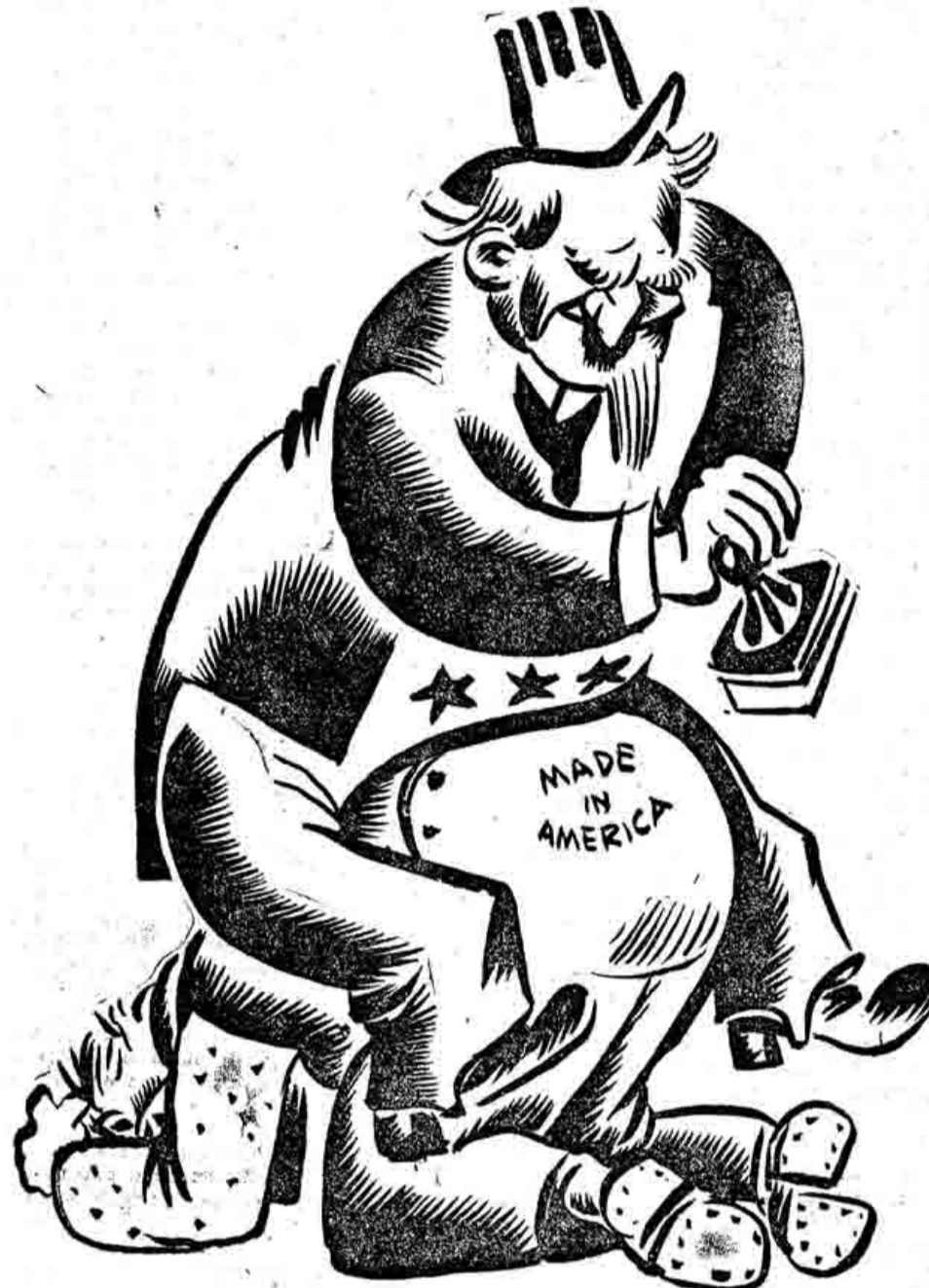
Drawn by William Gropper.