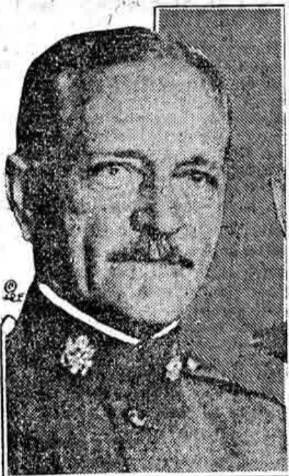
U. S. Spokesman in South America.

are told plainly that the ultimate sovereignty is not one nor the other, but the government of the United States.