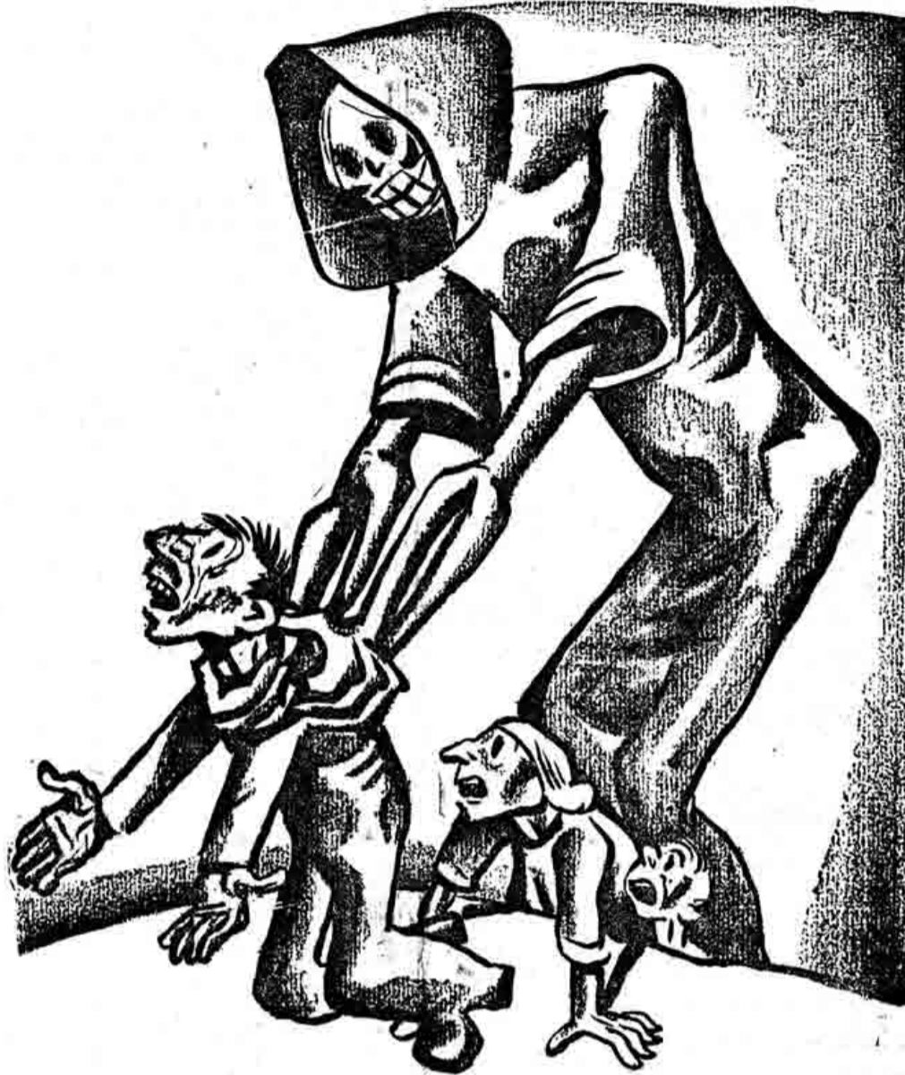
Starvation holds the British Miners in its deadly grip. Send donations to the International Workers' Aid, 1553 W. Madison St., Chicago.