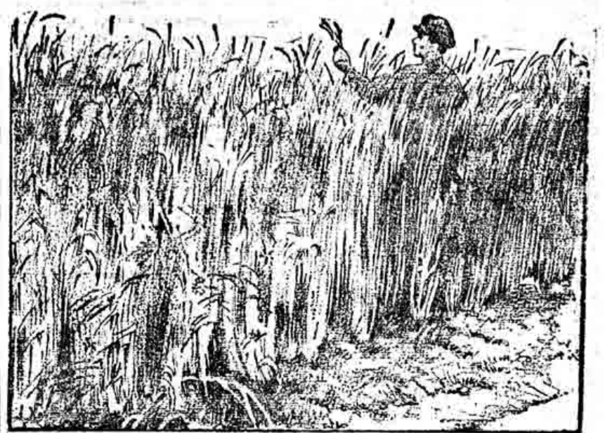
Nasha Gazeta (Our Newspaper) of Moscow pictures the harvest of the Soviet Union in the above illustration under the title, "Comrade Harvest of 1926."

A subscription to THE DAILY WORKER for one month to the members of your union is a good way. Try it.