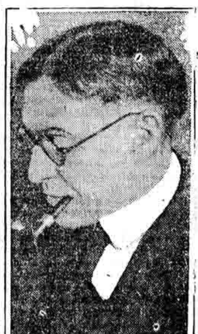
NEWTON D. BAKER.

sharpens their mentality. It teaches self-discipline and respect for constituted authority. It encourages initiative and gives young men confidence in their abilities. The thought and the act of preparing for service increase their patriotism. Association with men from all walks of life emphasizes our democracy. We take the young man out of his local environment and extend his