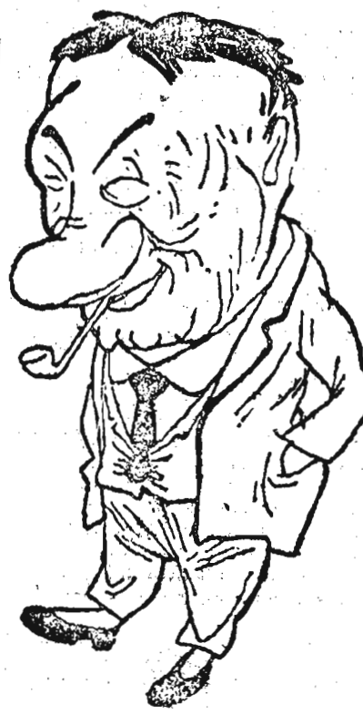
Stanley: "Keep cool old dear. Only for those jolly old Russians the miners would be eating cinders by now. However, your nice labor leaders are helping His Majesty keep the imperial fires burning with coal from abroad."