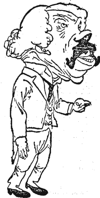
Ramsay: "Sorry old thing, but those ease-oosie miners refuse to dig coal for His Majesty's owners despite my efforts."

from the acceptance by the miners' executive of proposals, nominally arising from a church committee, for a settlement on the lines of the Samuel report and an eventual reduction in wages. These proposals, as they stand, are unacceptable to the government; but they open the way to a compromise in complete contradiction to every decision and expression of the miners; and the mere fact of these proposals being accepted by the miners' executive has aroused new hopes in the bourgeoisie, and alarm and protests in the miners' ranks.