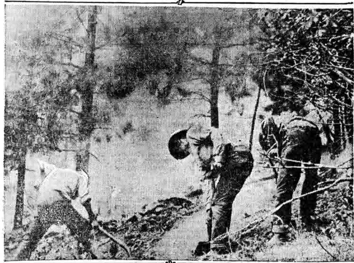
Great forest fires continue to spread in the northwest, especially in Idaho, Washington and Oregon. Volunteer fire fighters are here seen digging a trench to halt the sweep of flames thru the Boise Forest, near Boise, Idaho.