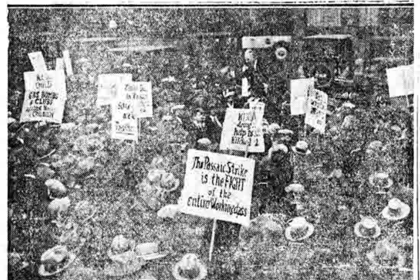
New York workers rally to open air meeting staged by the General Relief Committee of the striking textile workers of Passaic, New Jersey, now in the eighth month of their battle.