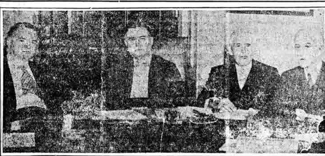
Here is a meeting of the Foreign Policy Commission that met just prior to Secretary of the Treasury Mellon's trip abroad. Left to right they are: Secretary Hoover, Senator Borah, Secretary Kellogg and Secretary Mellon. Andy has gone to Europe to see what all the falling money is about.