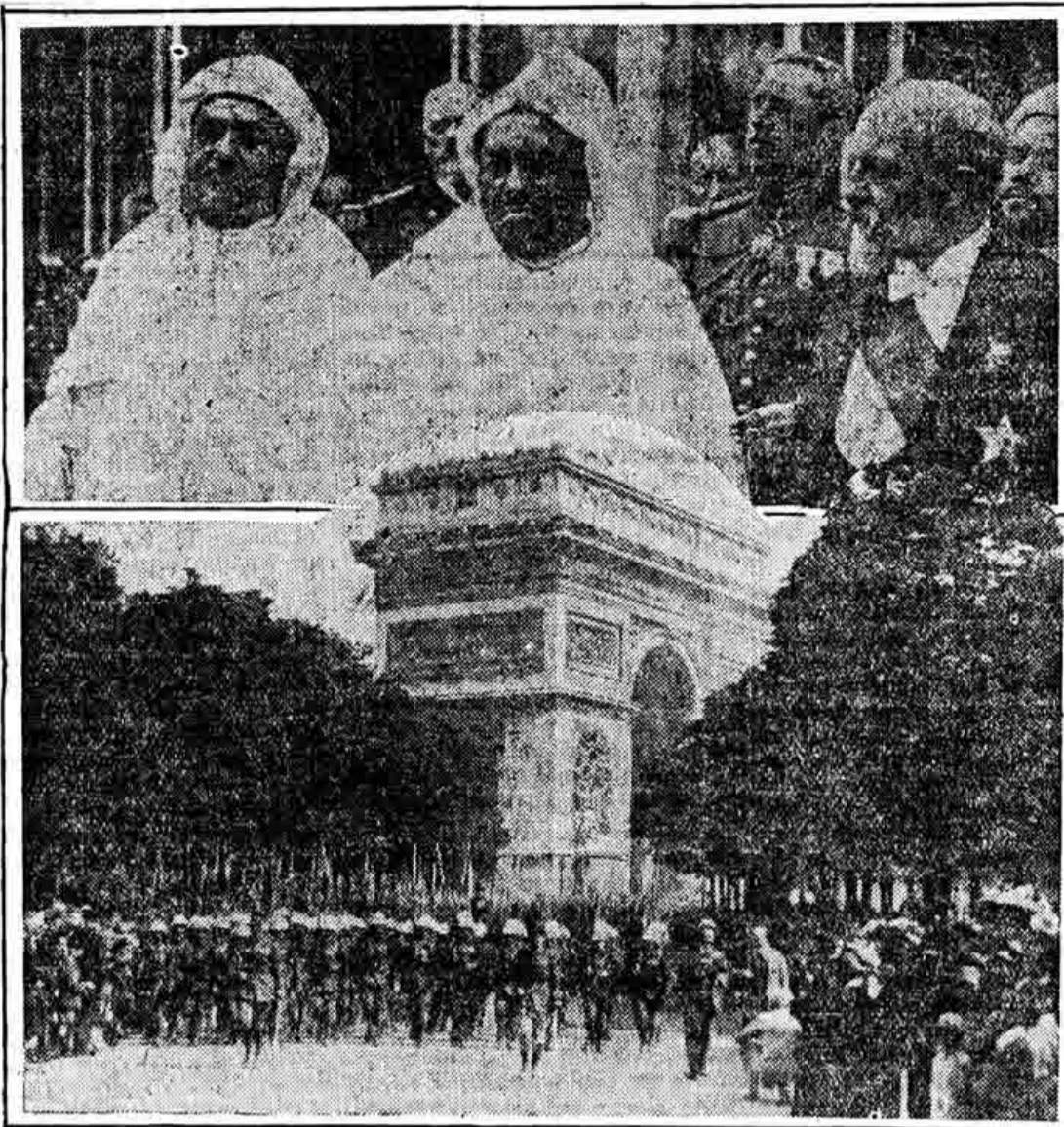
Military display marks observance of Bastille Day in France as usual. Above are the Moroccan peace delegates taking part in the exercises that were somewhat dampened by the severe financial crisis.