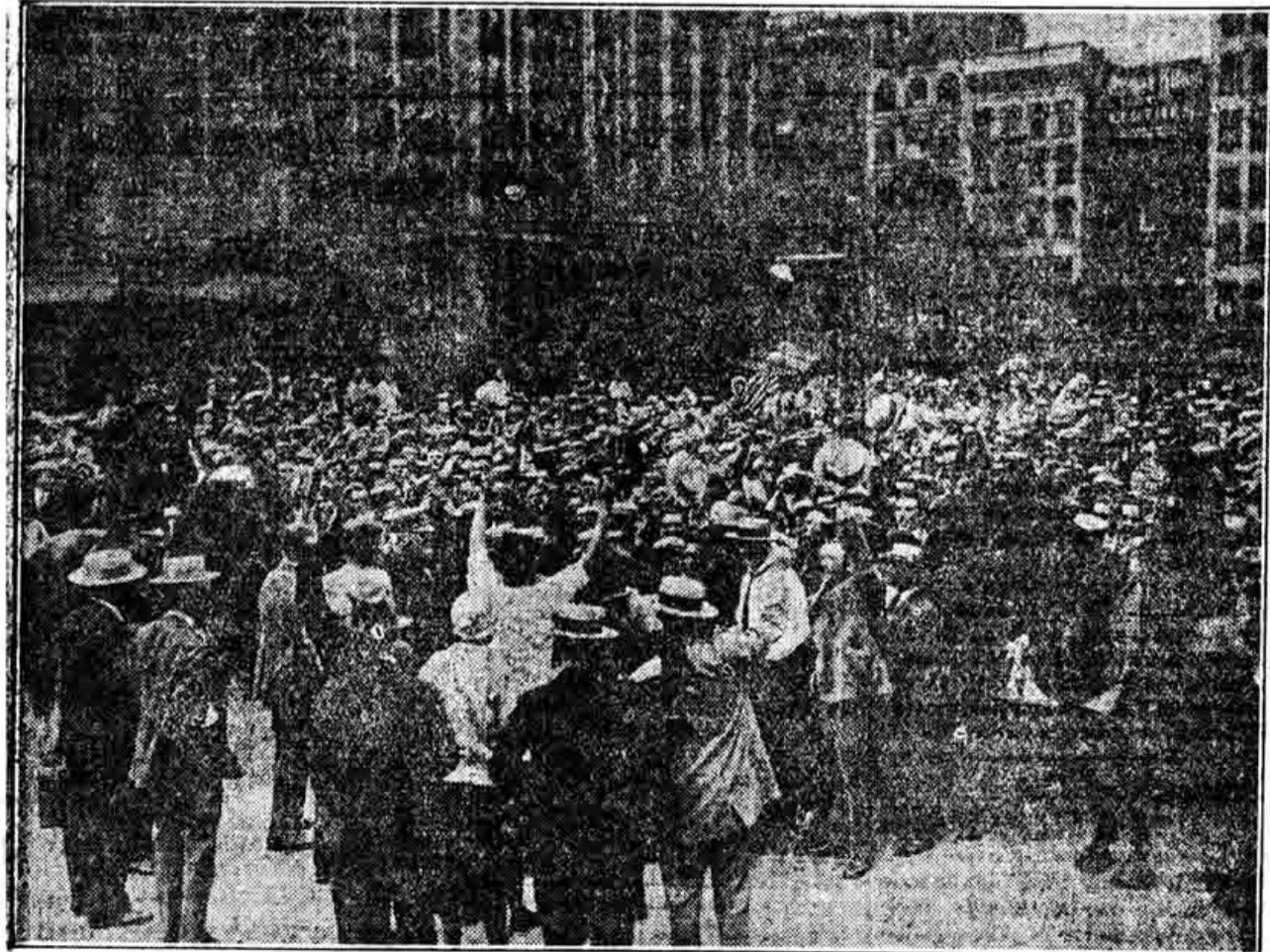
The enthusiasm of the I. R. T. strikers some of whom are shown here while accompanying their leaders to a conference with Mayor Walker at City Hall, New York, lasted until the very moment of defeat. In a large measure responsible for the difficulty of their struggle is the lack of support the strikers have received from the organized labor movement.

SOME 20,000 French war veterans paraded silently thru the streets of Paris in protest against the terms of the American debt