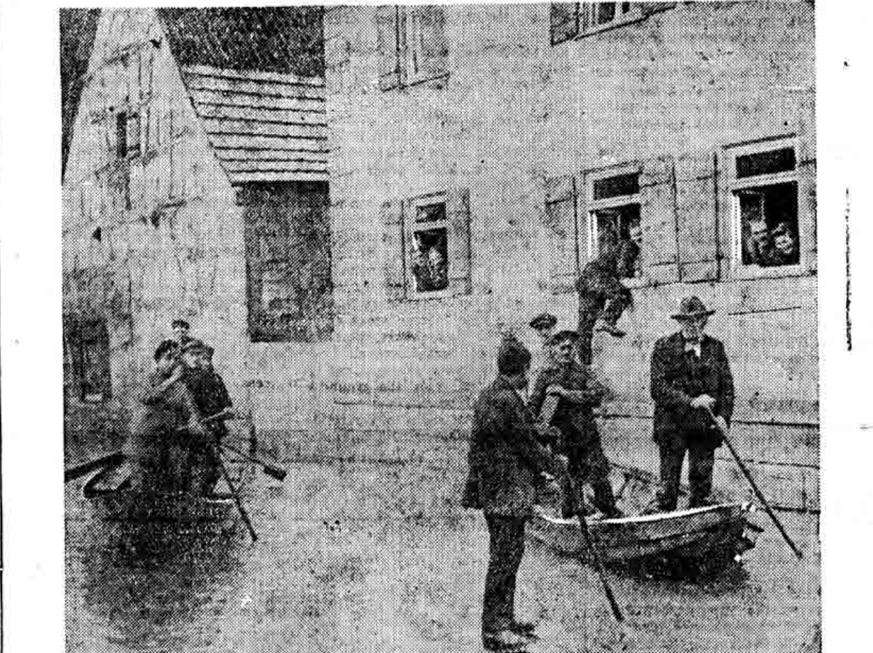
Flood waters of the Elbe and other rivers in Germany have inundated hundreds of thousands of acres of city and farm land and caused great distress. Coming on top of low wages and unemployment, the floods have added to the misery of the German workers over a large area of the republic.