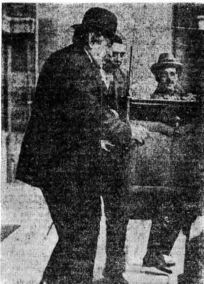
Altho Aristide Briand, shown above, is the premier, the real dictator in France is Joseph Caillaux who has been chosen by French big business to go the limit in getting France out of the ditch. One of his proposals is a "liberal" interpretation of the eight-hour day and increased taxes for the workingclass.