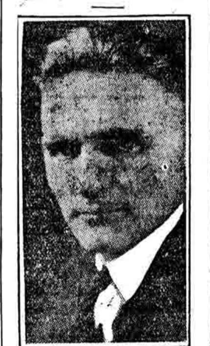
GERALD P. NYE