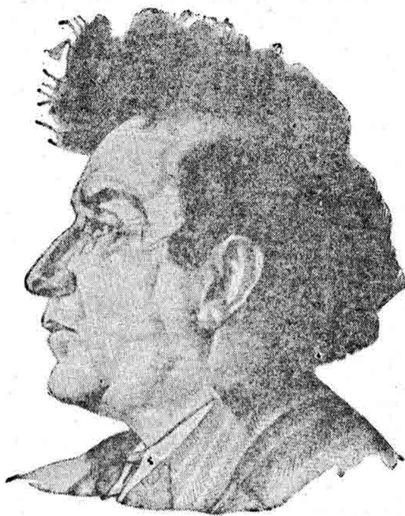
GREGORY ZINOVIEV President of the Communist International.

EDITOR'S NOTE—In today's installment of the report of the fourteenth congress of the Russian Communist Party, we publish the summary of the speech by Gregory Zinoviev, president of the Communist International, who led the opposition against the party's political bureau. Tomorrow there will be published the speech of Nikolai Bucharin against Zinoviev's position.