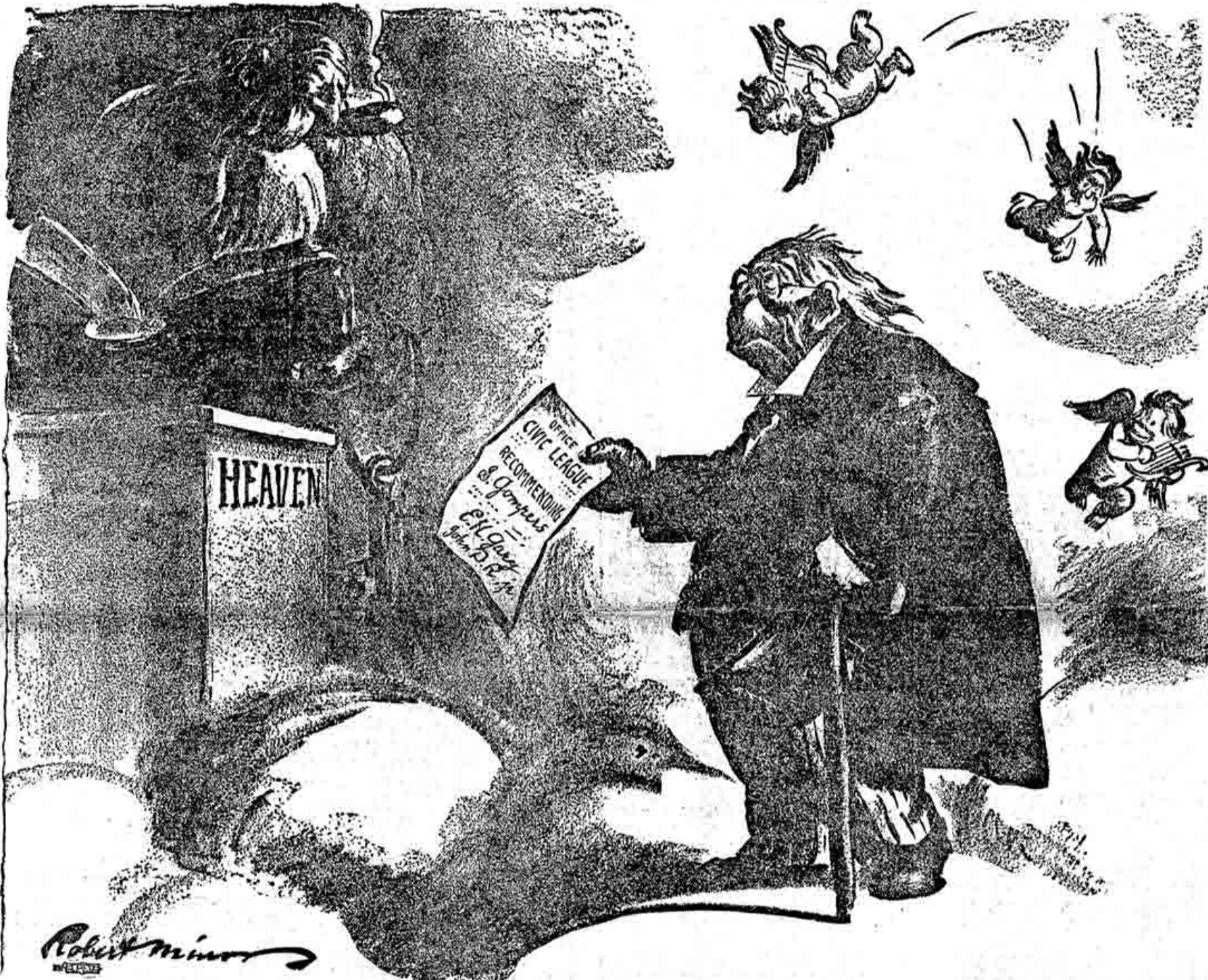
"YES, THIS IS AN OPEN SHOP, COME IN."