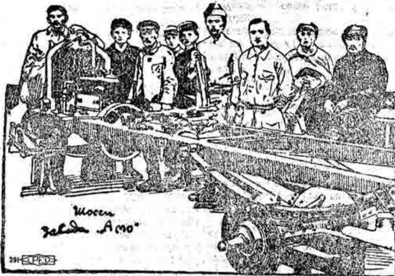
A group of workers at the Russian-American auto factory "Amo," near Moscow. Fifteen members of the Chicago Society for Technical Aid to Soviet Russia are working in that factory.