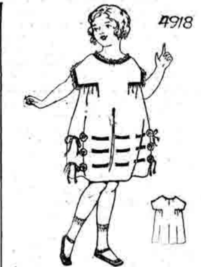
A "LITTLE GIRLS" FROCK.

4928. This is a splendid style for stout figures. The panel is a new feature. It may be omitted. Figured crepe and satin are here combined. Faile and silk alpaca would also be attractive. The dress may be finished without the panel and collar and may have the sleeve in shapel outline or close fitting as in the small views.