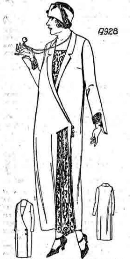
A MODEL FOR SLENDERIZING LINES

4928. This is a splendid style for stout figures. The panel is a new feature. It may be omitted. Figured crepe and satin are here combined. Faile and silk alpaca would also be attractive. The dress may be finished without the panel and collar and may have the sleeve in shapel outline or close fitting as in the small views.