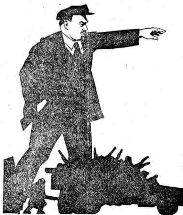
The Spirit of the Revolution