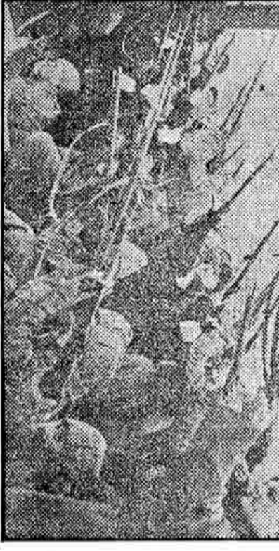
THE FIRST DAYS OF THE REVOLUTION

Then came the merger of the two tendencies into a Communist Party, which was the logical result of the social revolution of a revolutionary proletarian mass party, rooted in and supported by the economic mass organizations of labor. Both Tendencies Merged into One Party. Then came the merger of the two tendencies into a Communist Party, which was the logical result of the social revolution of a revolutionary proletarian mass party, rooted in and supported by the economic mass organizations of labor.