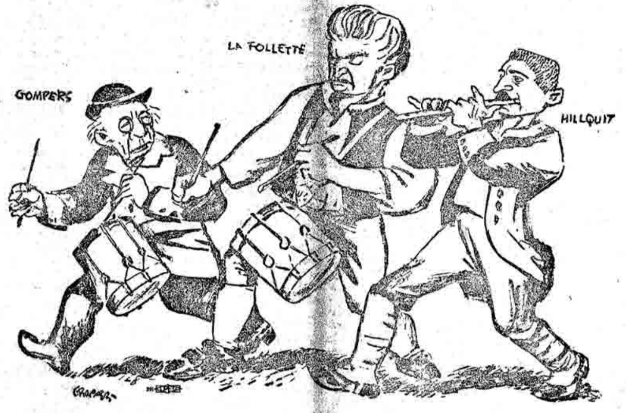
The Left Wing of Capitalism On the March—Backward