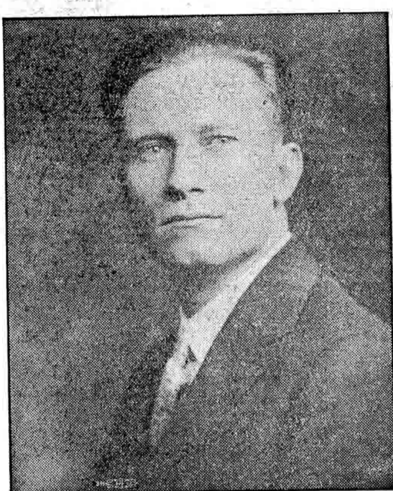
JAMES P. CANNON

Communist Candidate for Governor of New York.