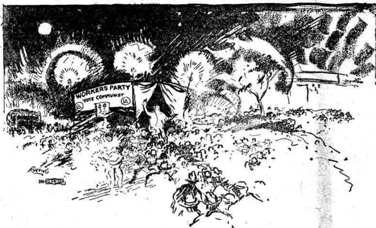
Corner of 110th St. and Fifth Ave., Night of Oct 10.