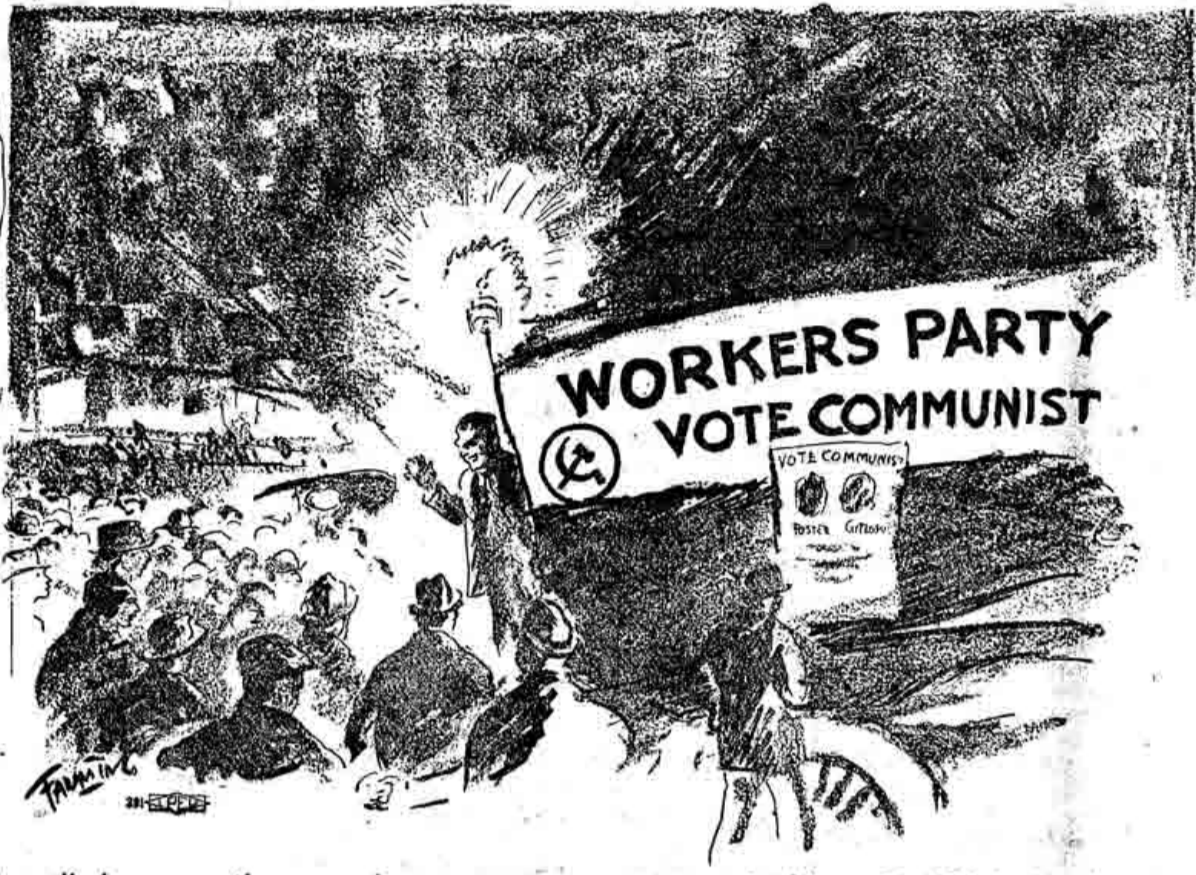
A preliminary meeting on a lesser corner to announce the bigger Red Night Meeting more centrally located.

credentials from their local unions. "All local unions are to continue on strike and ask all others to join the strike, subject to the action of the convention."