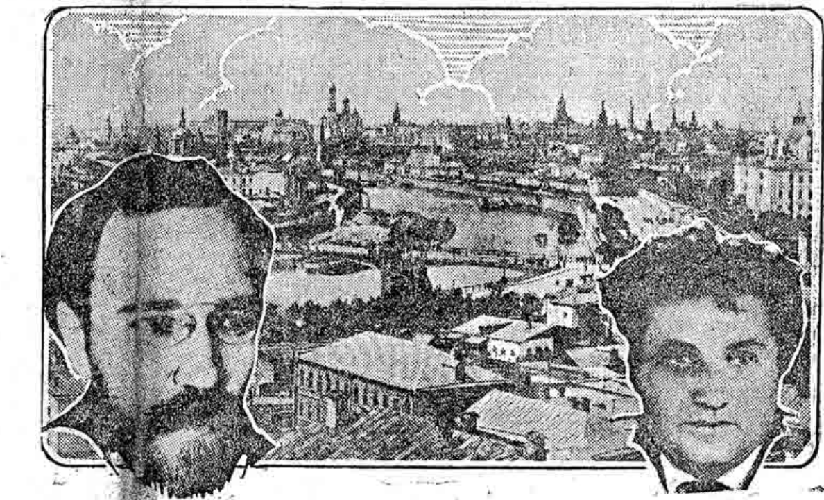
At left, Leo Kamenov; at right, Gregory Zinoviev; prominent Russian Communists and leaders in the Communist International. Also scene of Moscow as it appears today on the eve of the Seventh Anniversary of Russian Soviet Rule.