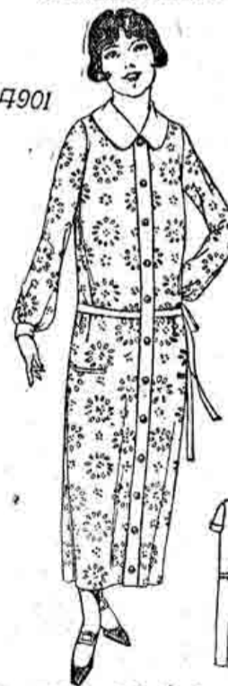
A SIMPLE DRESS

4901. This model is closed at the center front under the plait fold. The sleeve may be in wrist length, or short as shown in the small view. The front is finished with inserted pockets. This Pattern is cut in 4 sizes: 14, 16, 18 and 20 years. A 16 year size requires 3 1/2 yards of one material 40 inches wide. If made as illustrated in the large view it will require 3 yards of figured, and 1/2 yard of plain material. The width at the foot is 1 1/2 yards.