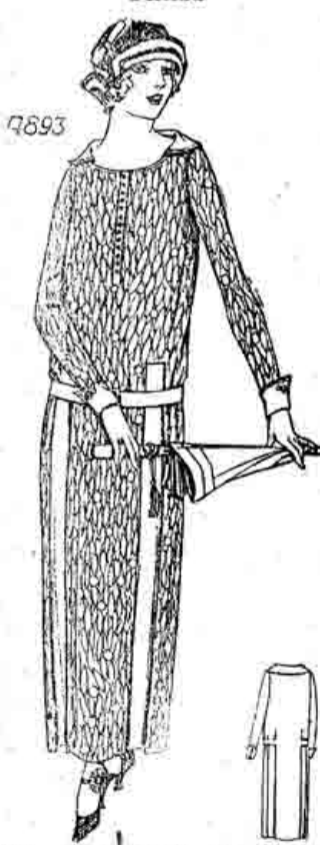
A STYLISH AFTERNOON DRESS

4893. Figured silk and crepe could be combined in this style, or, roshanara crepe and satin. The model is also good for charmeuse and kasha. The Pattern is cut in 6 sizes: 34, 36, 38, 40, 42 and 44 inches bust measure. If made as illustrated it will require 3 yards of 40 inch figured material and 1 1/2 yard of plain material for a 38 inch size. The width at the foot with plaits extended is 2 1/2 yards.