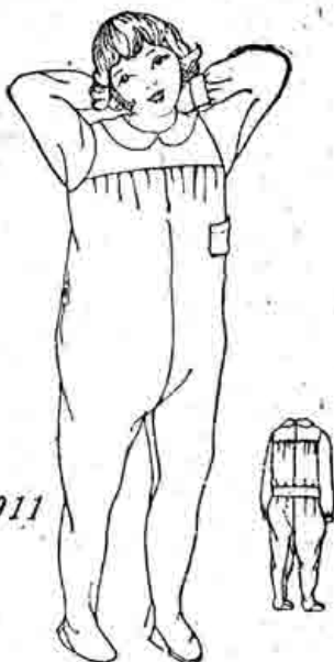
A COMFORTABLE "SLEEPING" GARMENT

4911. This is a good model for cold days, and especially for little ones who "slip" their bed coverings. Donnet or outing flannel, crepe, cambrie or long cloth may be used for this design.