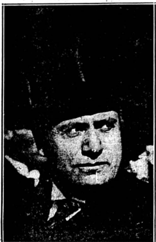
BENITO MUSSOLINI Leader of Black Reaction in Italy

MADRID, Aug. 29.—Five soldiers were killed and 39 wounded in fighting between Spanish convicts and rebels in the Western zone of the Moroccan battlefield.