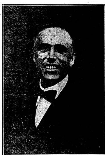
GIACOMO MATTEOTTI Victim of Mussolini Terror