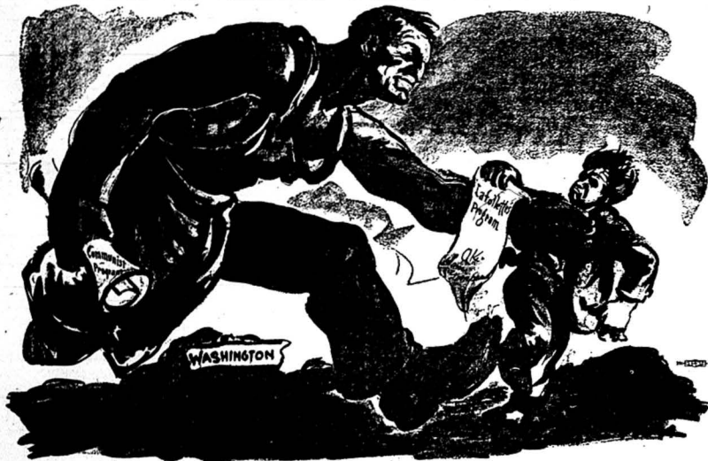
By Fred Ellis in the September 'Liberator.'