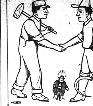
When the Workers and Farmers Get Together.