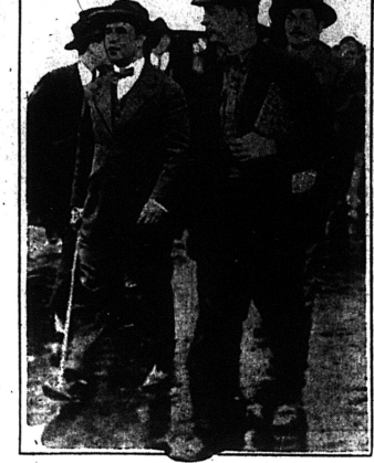
J. Vallant-Couturier (left) and Andre Marty, famous Black Sea pioneers, on their way to Chamber of Deputies accompanied by comrades.