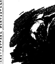
For a Workers' and Farmers' Government.

been in the actual fighting of the class struggle on the industrial field and they do not shrink from that fighting.