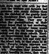
Walton is Thrud.