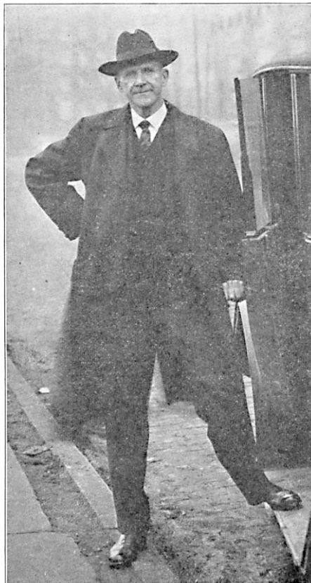
“Our Gene” at the start of his journey to Prison, from Cleveland, Ohio, Sunday morning, April 13, 1919.

While Kate Richards O'Hare was given one month to prepare for her five years' incarceration in the state penitentiary at Jefferson City, Mo., Debs was given only a few hours to bid his great and teeming world “Farewell!” until he had fed ten years of his life to the suddenly acquired appetite of America's Bastille for