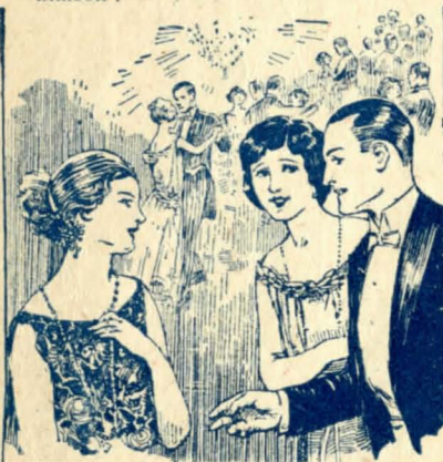
Perhaps you know how embarrassing it is to be introduced to strangers at a dance or other formal functions when you don't know what to say or do.