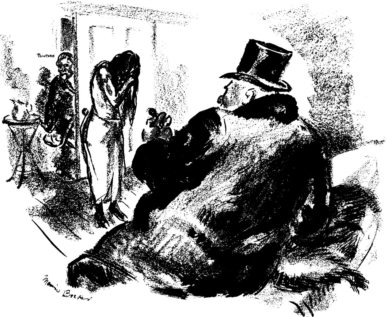
Morgan Saves the Franc