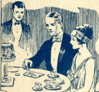
Do you know when and how to tip—and the correct amounts? The Book of Etiquette can tell you exactly what is correct.