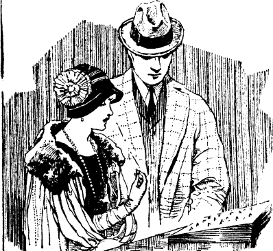
They are selecting a ring to seal their engagement, but both are ill at ease. Should he have chosen it by himself?