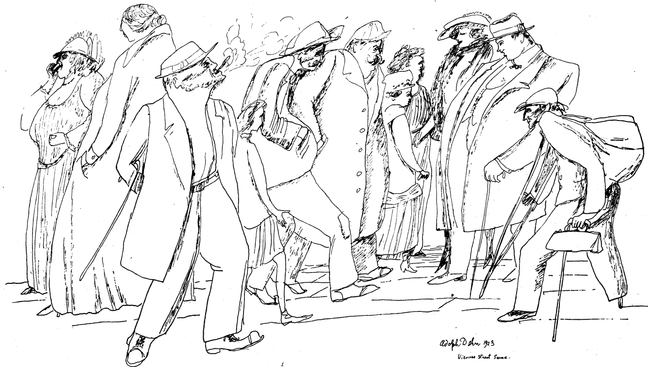
Viennese Street Scene