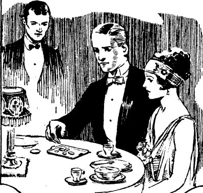
Do you know when and how to tip—and the correct amounts? The Book of Etiquette can tell you exactly what is correct.