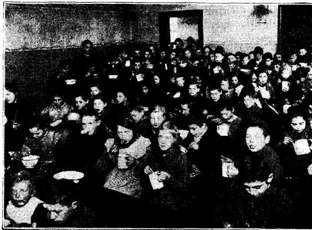
A Defeated Working Class of Germany is a Menace to the Working Class of America

"Will give away forever little daughter aged nine months. No compensation expected. Offers to be sent to the Agency of Lindenthal, B. H. 1390."