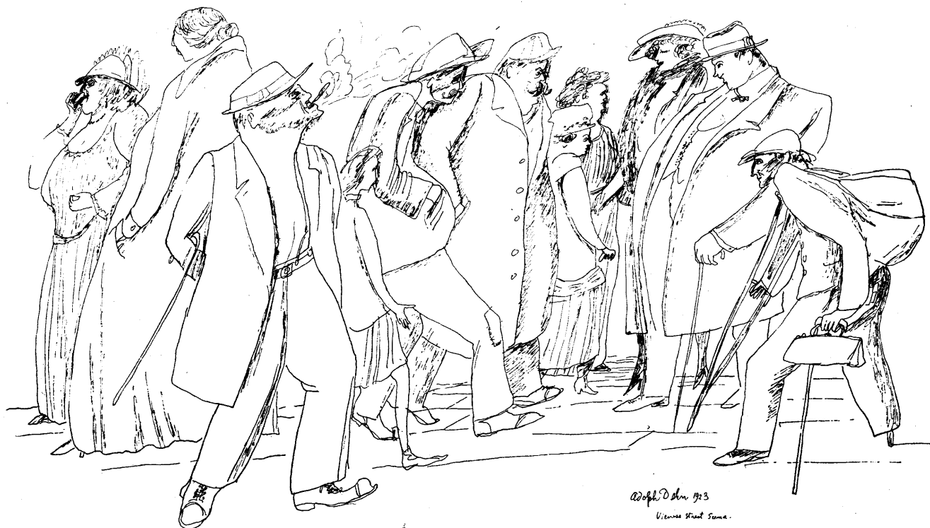
Viennese Street Scene