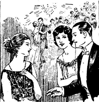
Perhaps you know how embarrassing it is to be introduced to strangers at a dance or other formal functions when you don't know what to say or do.