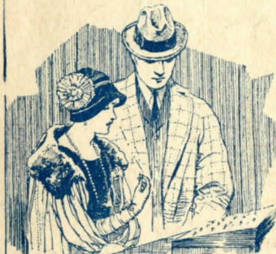
They are selecting a ring to seal their engagement, but both are ill at ease. Should he have chosen it by himself?