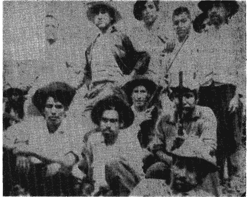
HUGO BLANCO, second from left (standing), revolutionary peasant leader of Peru, before his arrest.

This "lecturer" was on tour to ensure the continued flow of $1.5 million per day which the U.S. has been supplying the treasury of the Diem dictatorship. At home she is the instigator of the persecution of the Buddhists, and