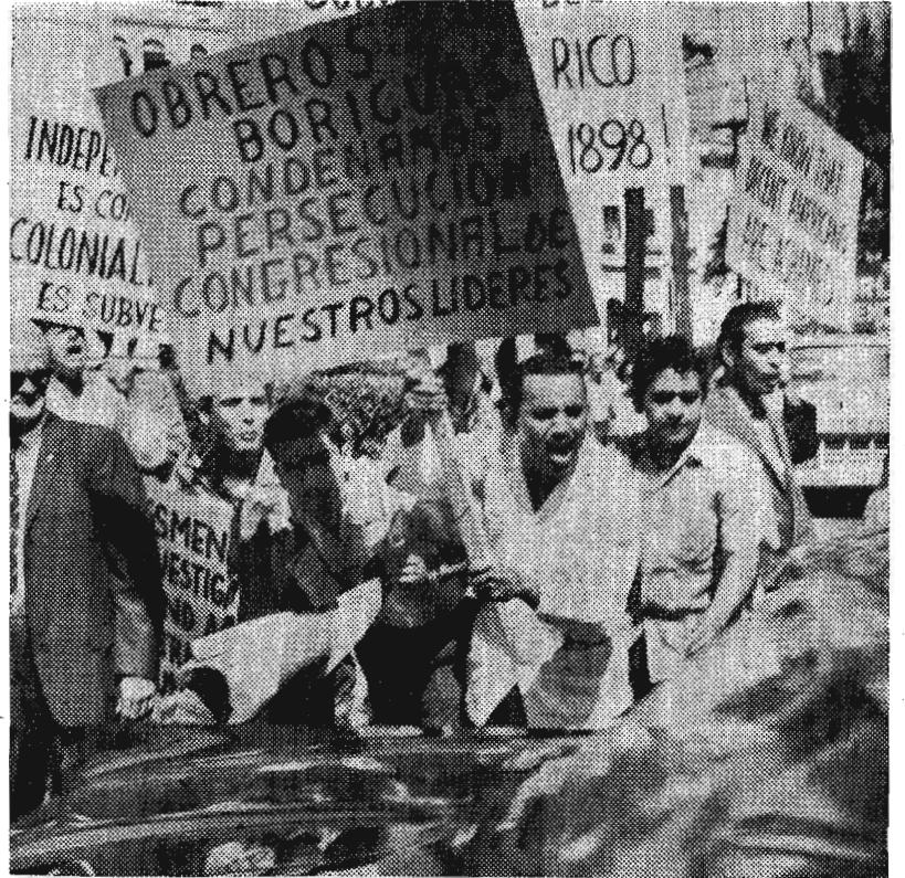
PUERTO RICANS demand HUAC inquisitors go home during witch-hunt in Puerto Rico in 1960.

"We love our cause, and we want art in our country to become just as genuine as our best architecture, poetry, prose, as our best films, as our various sciences, especially physics; we want art to help people to live, to arouse and educate, and not to be indifferent, embellished photography, which people pass by with a cold heart."