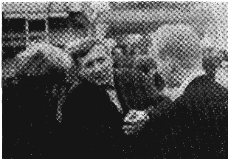
YEVGENY YEVTUSHENKO, center, talking with American newsmen during 1961 Helsinki Youth Festival.

The Militant 116 University Place, N.Y., N.Y.