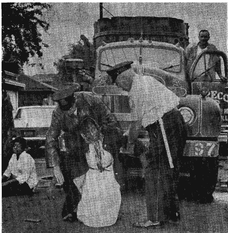
POLICE remove demonstrator protesting installation of "mobile school units" in Chicago ghetto.

It has been drilled into me in the various organizations I am involved in that the purpose is to wake people up, but ignorance doesn't bring about prejudice. We in the United States have been an enlightened people for years,