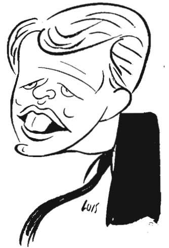
Robert F. Kennedy

labelling of the Communist Party as "foreign agent" was a transparent excuse to outlaw that political party and was a serious