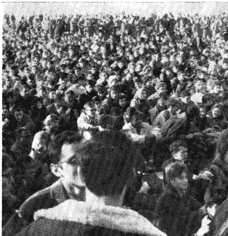
5,000 students gathered in Washington, D. C., February 1962 to oppose U. S. resumption of A-bomb testing.

(Continued from Page 1) YPSL maneuvered to tighten the SPU Statement of Purpose and make the SPU accept their "Equal Blame Theory" — YPSL's contribution to the analysis of the cold war. This method of operation is exactly wrong, and is diametrically opposed to the real needs of SPU, which are to unite as broad a mass of students as possible who wish to struggle for peace, regardless of their political viewpoint.