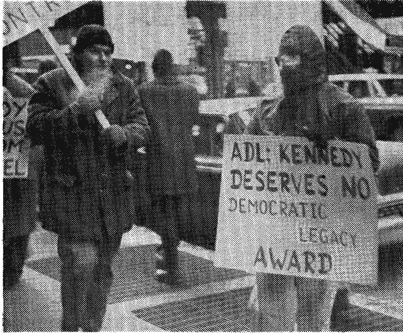
These students demonstrating in sub-zero weather in Chicago show the determination of youth who support William Worthy against the persecution of the Justice Department.