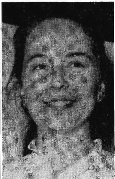
Vilma Espin—young revolutionary leader in Cuba

The pro-Capitalist press mistakenly sees this as some sort of clique struggle for power. It is in reality but another step towards the realization of the real ideals of Marxism-Leninism in the Cuban revolution. This speech reflects the democratic orientation of revolutionists in Cuba including thousands in the P.S.P. This attack is aimed at a tendency, a remnant of bourgeois ideology which seeks privileges, which seeks to govern for personal gains. Explaining the leadership's attitude on this question Castro explained, "We waged a war, we led it, we won it, and there are no general's stars on our shoulders and no medals hang from our chests. And the first law which we proposed when we assumed governmental power prohibited the erection of statues—these problems related to the cult of personality were not discussed as much then as they are now—but out of deep conviction we proposed prohibiting the erection of statues of living persons, the naming of streets after living persons and, what is more, that the placing of our portraits in govern-