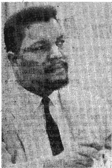
Robert F. Williams