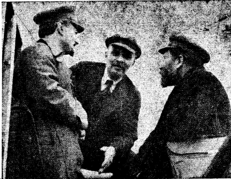
TEAMWORK: The Bolshevik team of Trotsky, Lenin, Kamenev and Zinoviev insured full discussion and democratic decision by all members of the Communist International.

National revolutions which overthrow capitalism will lead to war, Khrushchev claims, mimicking Stalin. On the contrary, state the Chinese. "The forces of the masses of the people of various countries and their struggle are the decisive factor in checking war and defending world peace. War can be held at bay and world peace preserved only by continually strengthening the forces of the people in the countries of the socialist camp, the liberation movements of the Asian, African