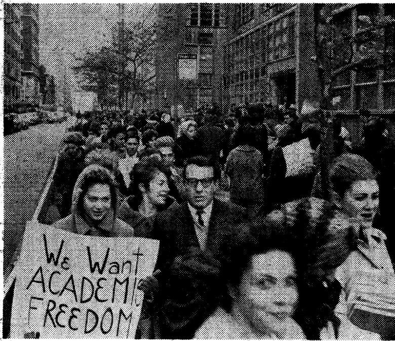
PROTEST BAN: Hunter College students staid out of classes for one full day to protest the infringement on their academic freedom. It was this kind of demonstration that brought about the reversal of the speaker ban.