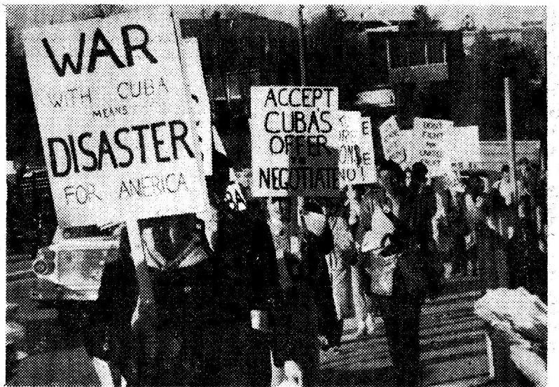
SEATTLE DEMONSTRATION: Citizens from the state of Washington show that they want an end to U. S. aggressive policies toward Cuba. They linked their picket line with a city-wide demonstration against preparations for a third world war.