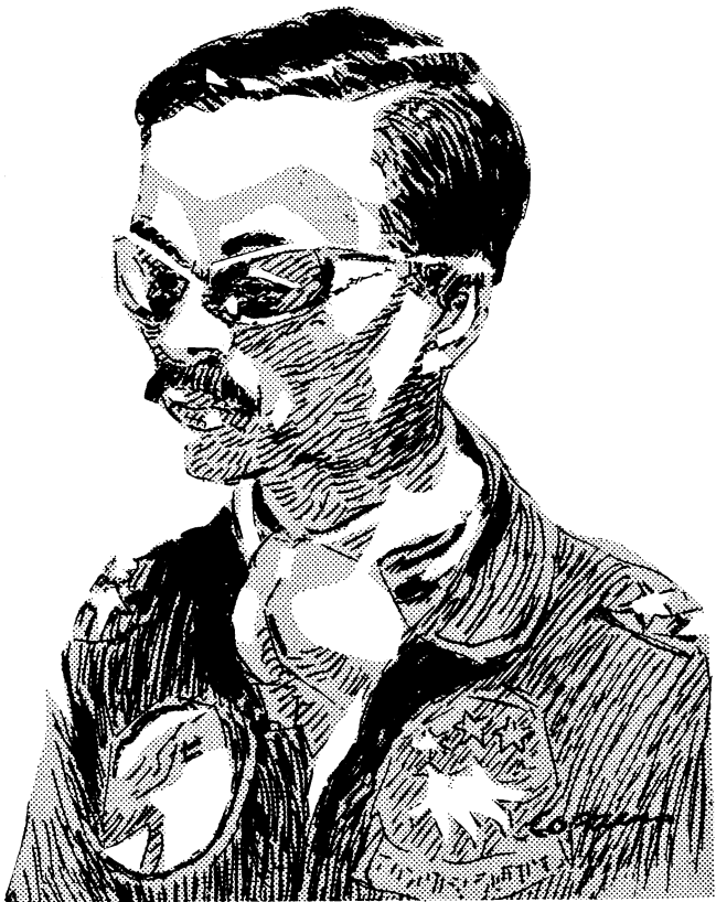
NGUYEN CAO KY