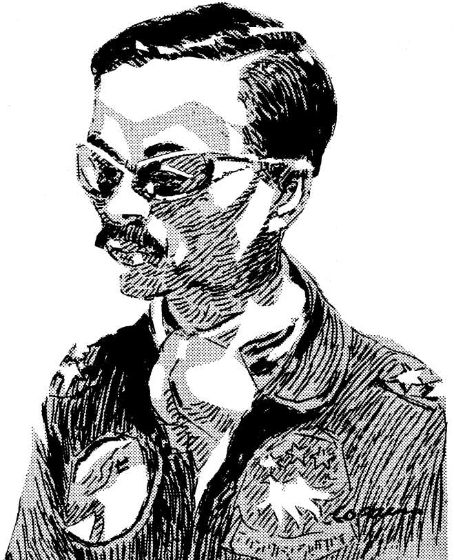
NGUYEN CAO KY

"But the situation here is so desperate now that one man would not be enough. We need four or five Hitlers in Vietnam."