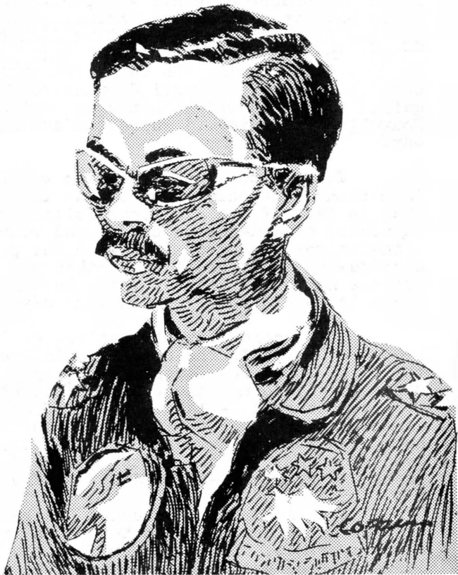
NGUYEN CAO KY