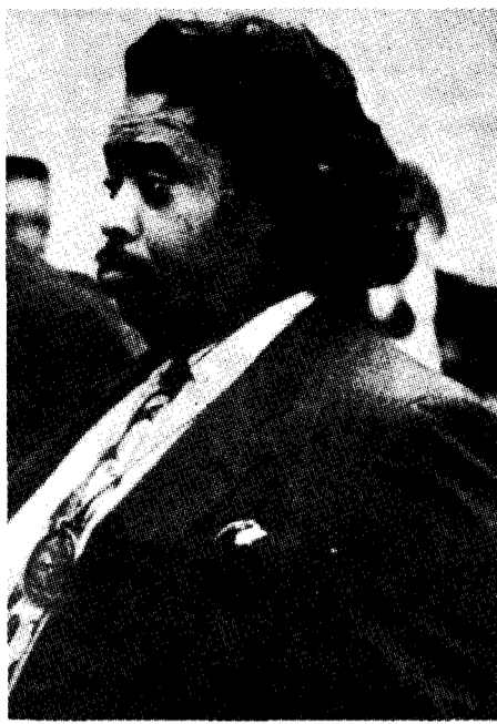
Finks come in all shapes and sizes.