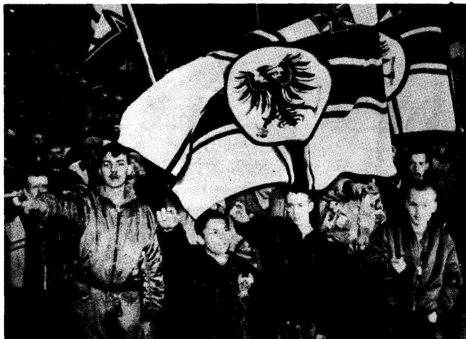
Nazi skinheads in Halle, November 1991. For worker/immigrant defense against fascist terror!

And the "order to shoot"? The widely publicized 1991 book by Peter Przybylski, Tatort Politbüro: Die Akte Honecker (The Politburo Case: The Honecker File) , claims: "The minutes of the 45th meeting of the National Defense Council of 3 May 1974 show that the chairman Honecker literally stated: 'As before, with attempts to break through the border, weapons must be ruthlessly