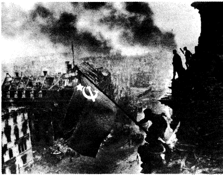
30 April 1945: Red flag raised over the Reichstag as Soviet troops vanquished Nazi Third Reich.

According to the bourgeoisie's penal code, the swastika is banned. But who would expect the self-proclaimed successor state to the Third Reich to take action against Nazi symbols? In reality its police protect the Nazis in their assaults on refugee hostels, while the victims of the Nazis are either deported or made out to be criminals. Behind the outcry against "violence" and "extremism of the right and the left" stands the racist persecution of refugees and immigrants as well as expanded police repression against anti-fascists. This is why the call for "more police" and for banning the fascists by the PDS (Party of