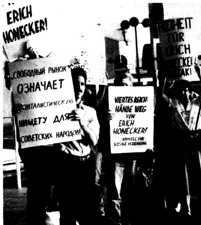
Spartakists at Tegel Airport, Berlin, July 1992, as Honecker is brought back for trial. Sign reads: "Fourth Reich: Hands Off Erich Honecker!"

him in the back, this ultimately leads Honecker to backhandedly support capitalist reunification, saying at the trial: