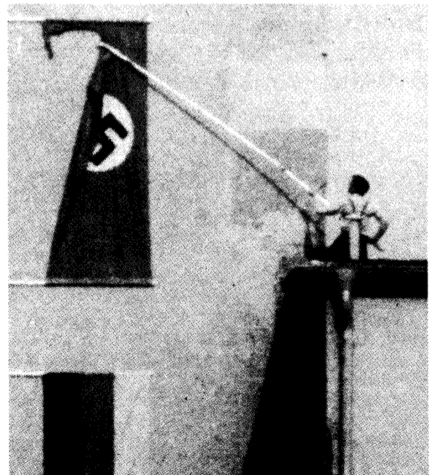
23 June 1992: Our comrades rip down swastika flag near Berlin’s Brandenburg Gate.