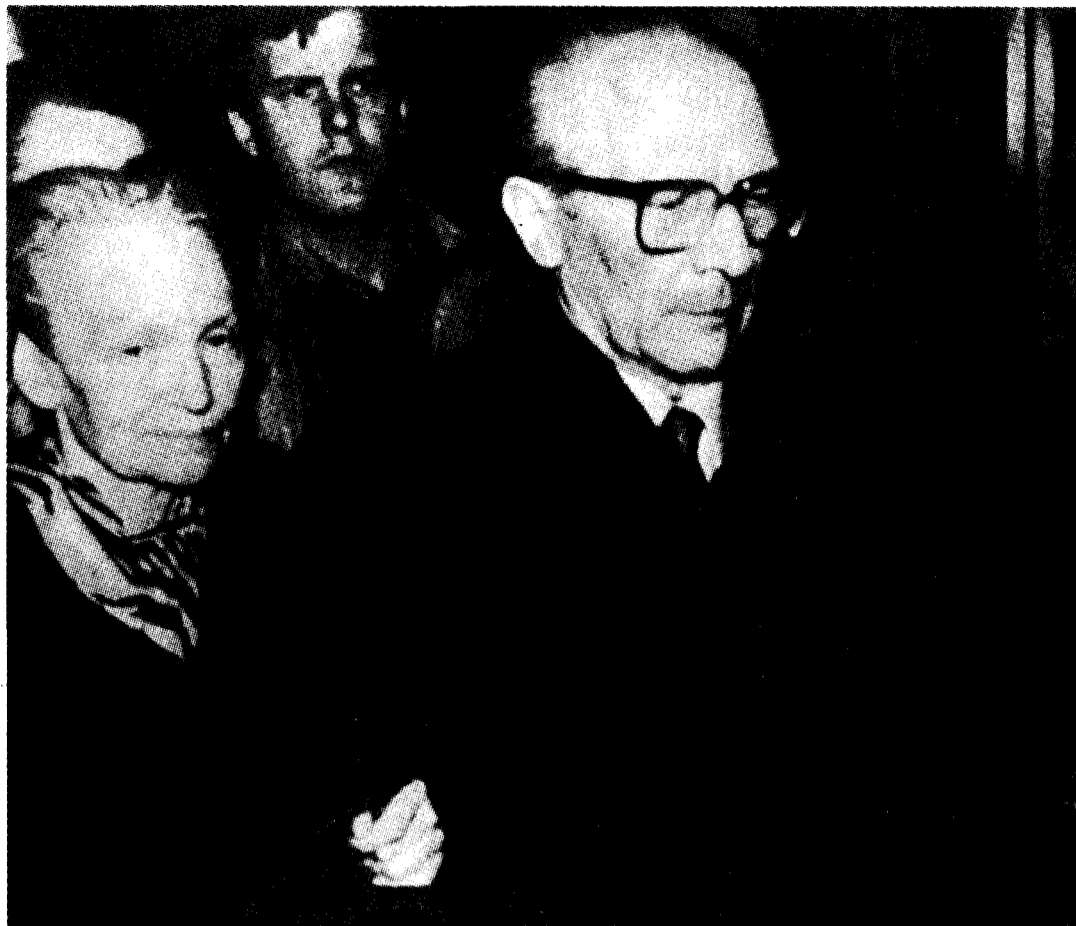
Former East German leader Erich Honecker being arrested by vindictive West German bourgeoisie in 1991. Guardian [London]