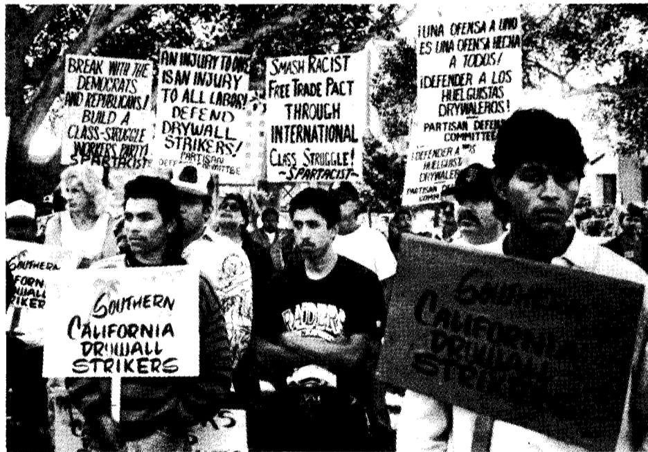
Striking San Diego drywallers protest police repression at rally on January 23.

WV replies: The six-month-long strike by Southern California drywall workers