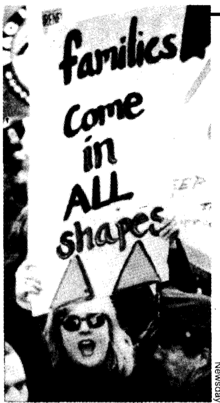
October rally (left) in support of multicultural curriculum. Anti-gay bigots in Brooklyn District 15 (right).