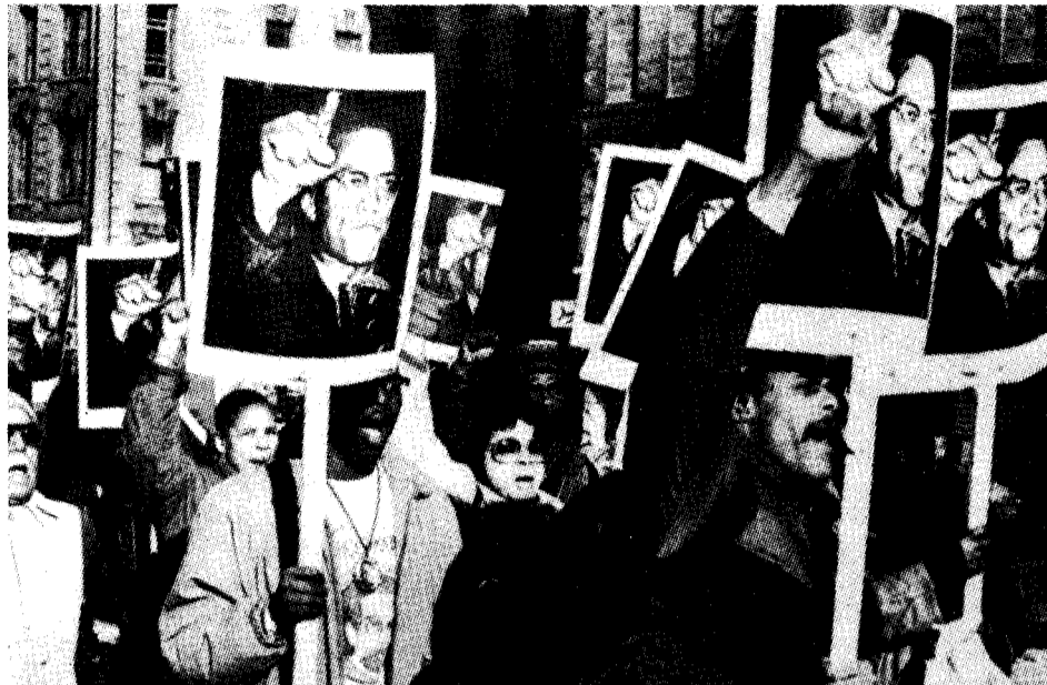
Demonstrators honor Malcolm X at February 1990 protest to save Audubon Ballroom (above). Protests against Columbia's plans to build a gym in Morningside Park (below) fueled 1968 student strike.