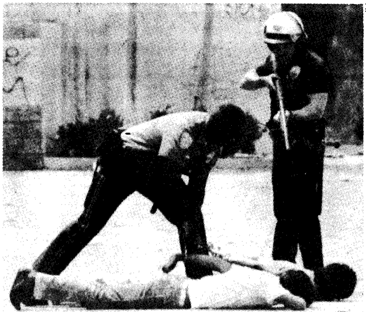
Racist cops of capitalism gunned down 120 people in Los Angeles in 1990 alone.

While they were accused of aiding the "Trotskyite-Zinovievite criminals," they were not just former "deviationists" (the actual Trotskyists were long gone). Rather, except for Ulbricht and Wilhelm