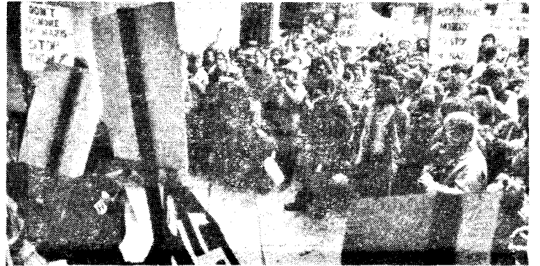
Ann Arbor: 20 March 1982