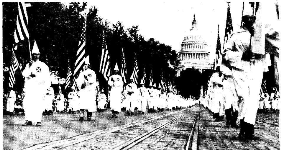
Washington, D.C., August 1925—40,000 Klansmen marched. It must not happen again!

The Klan was born out of the heat of bloody counterrevolution in the South after the Civil War. The Second American Revolution, which was begun to prevent secession, ended by crushing the Southern slave system and placing the industrial-based Northern capitalists (represented by the Republican Party) in command. To consolidate its victory the revolutionary bourgeoisie granted formal political rights to the freed slaves, and during Reconstruction black