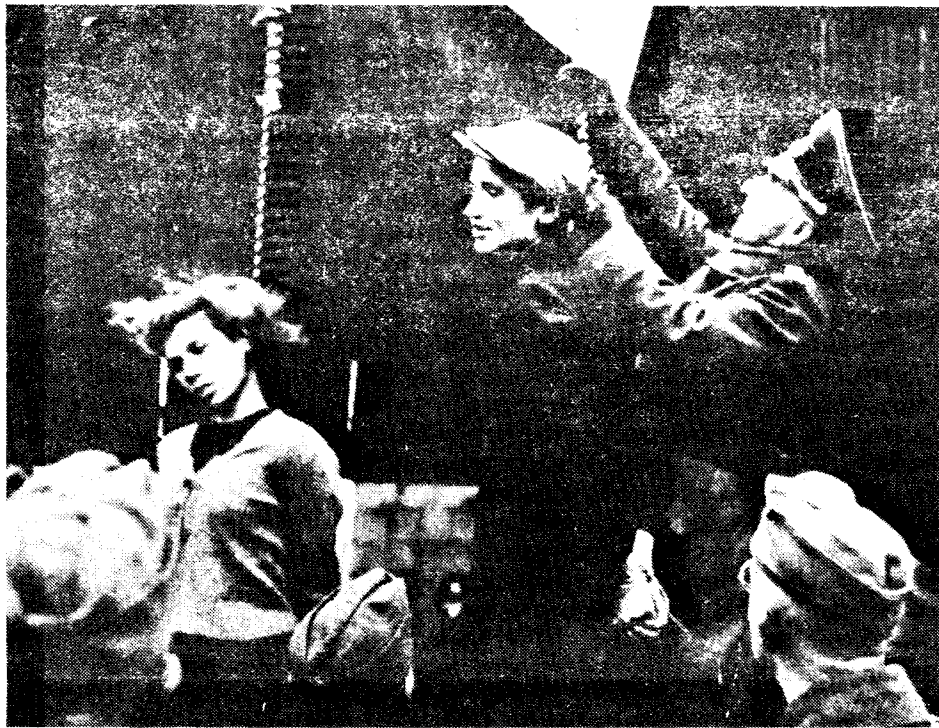
Minsk, 1941: Hitlerite death squad executes anti-fascist partisans. Byelorussian Nazis massacred more than 200,000.