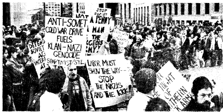
Boston: 16 October 1982