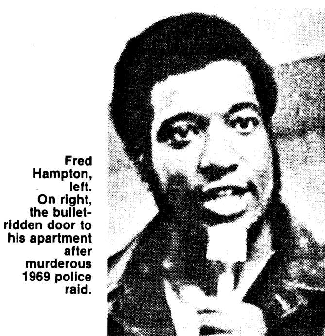
Fred Hampton, left. On right, the bullet-ridden door to his apartment after murderous 1969 police raid.

The murderous 4 December, 1969 raid on the Panther headquarters at 2337 West Monroe on Chicago's West Side was the "high point" of the government's concerted nationwide campaign to "get the Panthers." FBI documents made public during the course of this and subsequent Panther cases prove it. The COINTEL program, originally conceived by FBI chief