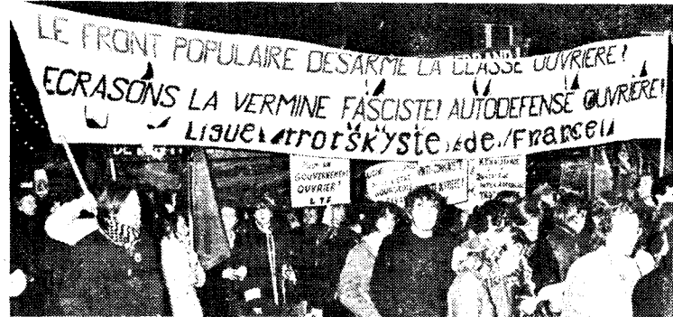
Rouen, France: 11 December 1981