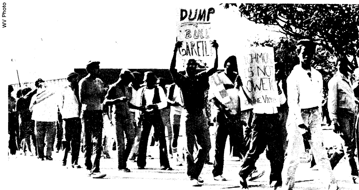
Angry protest against racist cop murders in Richmond, California October 23.