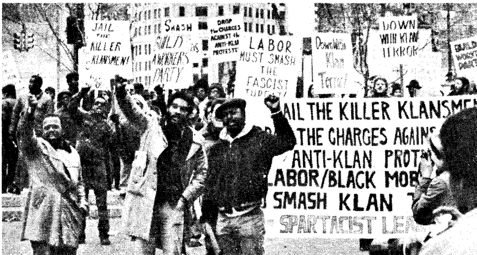
Detroit, November 1979: 500 blacks, auto workers and leftists stopped the Klan.

The answer can be found by looking at those places where the fascists were stopped in recent years, for instance: in Detroit, November 1979, when the Klan planned to hail the Greensboro massacre; in San Francisco, April 1980, when the Nazis said they'd "celebrate Hitler's birthday" in front of City Hall; or last March, when the Nazis tried to goose-step in Ann Arbor; and in Chicago on June 27, where the Nazis tried to stage a "death to gays" march. In each of these cases the fascist scum were physically prevented from carrying out their provocations by masses of protesters, from hundreds to several thousand trade unionists, blacks, Latinos, Jews, Catholics, homosexuals, socialists—all the potential targets of KKK/Nazi terror. We of the Spartacist League (SL) initiated these successful actions by mobilizing layers of the labor movement as the necessary core of the anti-fascist fight. And again last month in Boston the SL was in the front lines as 1,500 enraged protesters drove a bunch of white-robed Klansmen off the streets.