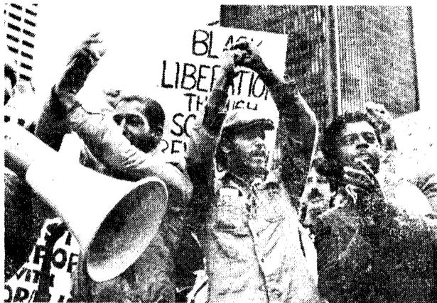
Boston, October 16: 1,500 demonstrators run the Klan out.

Blaming anti-racist demonstrators for the violence of the Klan and Nazis is the same kind of anti-communism that comes out of the mouth of the liberals and the racist courts, for instance, on the Greensboro racist massacre. And I saw with my own eyes NAROC, along with union bureaucrats, black and church misleaders, that offered up black, white and Latino