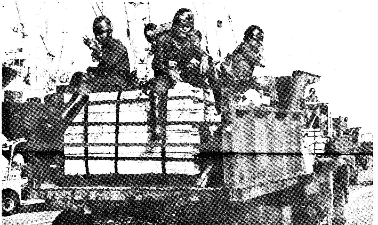
"Human Rights" Reagan-style: U.S. death cargo arrives in El Salvador, July 1982.