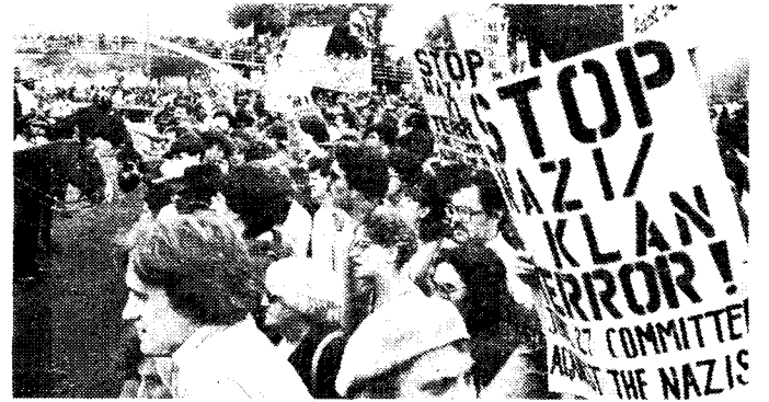
Chicago: 27 June 1982

International Spartacist tendency in anti-fascist mobilizations.