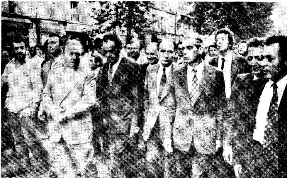
Leaders of the French "Union of the Left" in 1973. From left: George Seguy (in turtleneck), head of CGT labor federation, George Marchais, head of CP, François Mitterrand, head of Socialists; Jean Fabre, head of the Left Radicals.