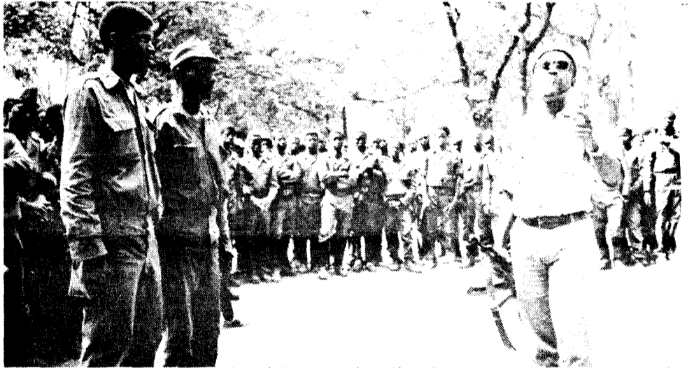
Amílcar Cabral addressing PAIGC troops.

It is true that the native bourgeoisie is weak in many black African countries. But it definitely exists, if only on the fringes of the state bureaucracy, and is constantly growing. Moreover, it is wrong to see these weak, often totally artificial states in isolation from the capitalist world as a whole. Through the officer corps and top bureaucrats, the native bourgeoisie and the tremendous power of the imperialist corporations and governments, effective control of even the most radical nationalist African states remains in the hands of the capitalist class. There can be no talk of