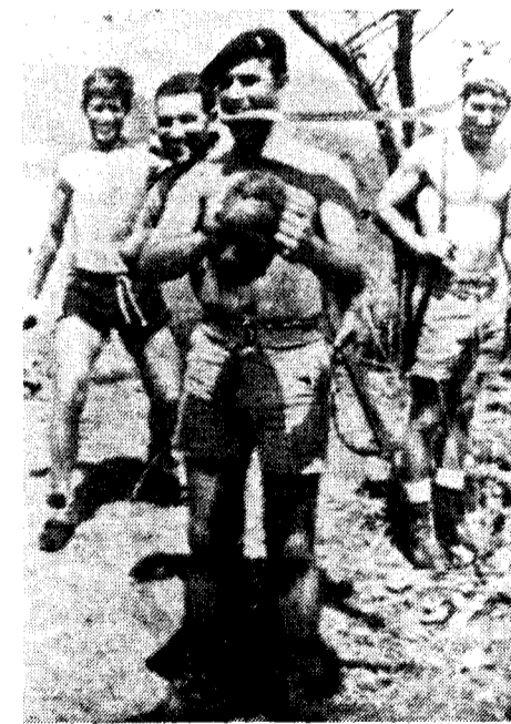
Portuguese soldiers display trophy.

The 200,000 Portuguese settlers in Mozambique are an obstacle to any settlement which promises independence to the black majority (8 million). Already various groups of rightist settlers have been formed similar to the Algerian pieds noirs' OAS. No doubt