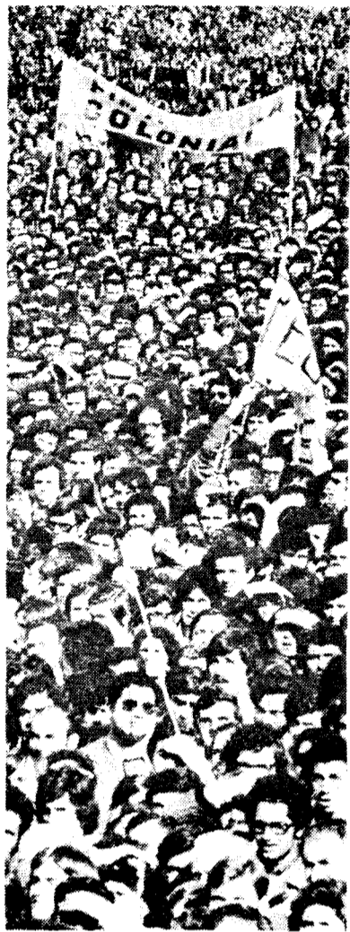
SYGMA End the Colonial War! Demonstration in Lisbon.