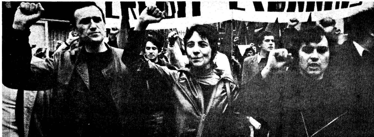
Lutte Ouvrière presidential candidate Arlette Laguiller marching in May Day demonstration.

Furthermore, on her last television appearance before the elections, Laguiller appealed to the 53 percent of the population which is female to vote for