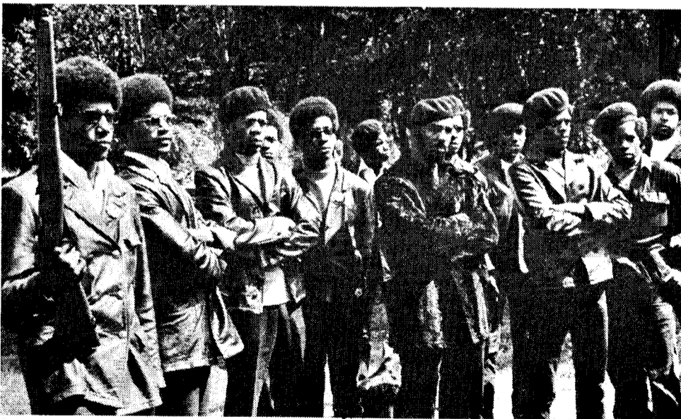
Black Panthers at Marin City, California, August 1968.

In the article "Birth of the Zionist State, Part 2/The 1948 War," in WV No. 45, 24 May, it is stated that Jordanian King Abdullah explained to the Zionists that he "had no interest in occupying the Jewish districts." Rather, he declared his disinterest in occupying the areas allotted to the Jews under the UN partition plan. In the article "Balaguer 'Wins' Rigged Dominican Elections," in the same issue, one sentence reads, "By forming a political bloc with sections of the bourgeoisie these Marxists are paving the way for their own destruction...." The word "Marxists" should have read "Maoists."