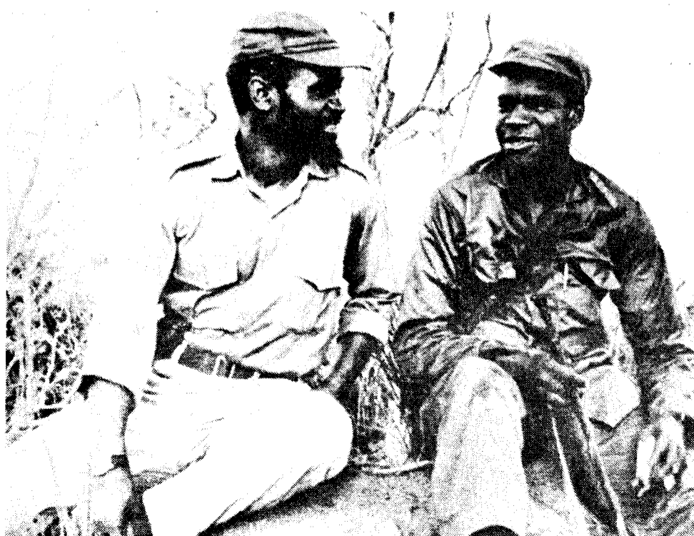
FRELIMO leaders Eduardo Mondlane (left), and Samora Machel in 1968.