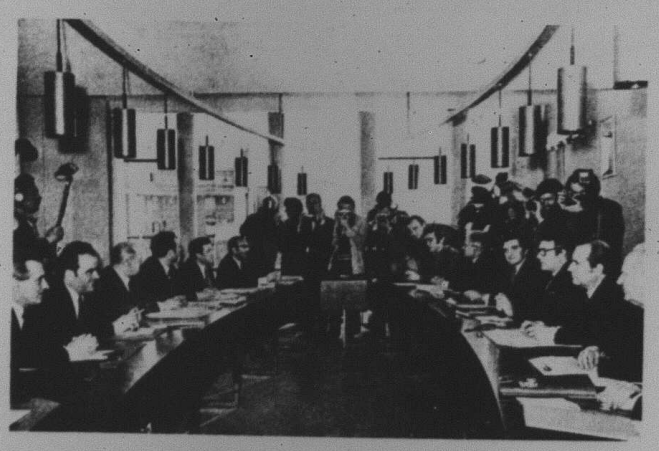
Communist Party and Socialist Party leaders planning campaign

The Common Program itself scarcely addresses the real needs of the French working class. It is a tissue of vague promises and meagre