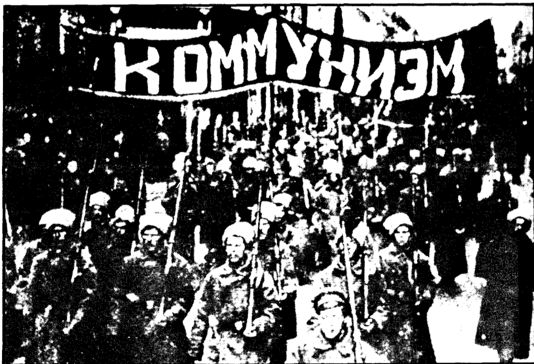
Russian soldiers march under banner of Communism, 1917.

■ The October revolution put socialism on the order of the day throughout the world. It revived and shaped and developed the revolutionary labour movement of the world out of the bloody chaos of the war. The Russian revolution showed in practice, by example, how the workers' revolution is to be made. It revealed in life the role of the party. It showed in life what kind of a party the workers must have. By its victory, and its reorganization of the social system, the Russian revolution has proved for all time the superiority of nationalized property and planned economy over capitalist private property, and planless competition and anarchy in production. ■