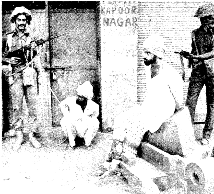
Indian army terrorising Sikhs in the Punjab.

The Sikhs are not about to take it lying down. In one suburb of New Delhi, a retired Sikh army captain opened fire with a sub-machine gun against the invading Hindu mob, killing twenty. Meanwhile Sikh fundamentalists talk of getting their own back in the Punjab, where Sikhs are a slight majority. Today many Sikhs identify with and continue to adulate Sant (saint) Jarnail Singh Bhindranwale, the extreme fundamentalist who once threatened to kill 5000 Hindus and who was among those killed in the Golden Temple massacre. But in the country as a whole they form only 2 per cent of the total population of 700 million; they will pay a high price for the vengeance taken against the butcher Gandhi. Still the Sikhs have a substantial measure of social power, considerable military expertise and a border with India's arch-enemy Pakistan, with its already established CIA network for supplying the reactionary Islamic insurgents in Afghanistan.