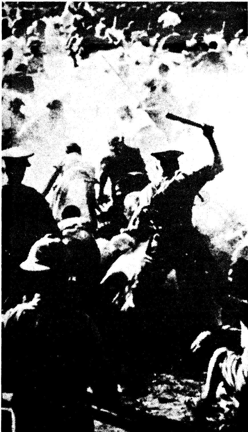
Apartheid terror and its Achilles heel: (Top) Black mineworkers in Welkom, S.A. during a speech by Teboho Noka, organiser for the South African National Union of Mineworkers, March 1983. (Bottom) Meeting of South African black women attacked by apartheid police, Cato Manor, 1959.