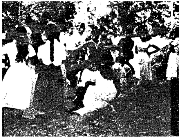
Young Sinhalese women at Magnum Garments have been on strike since July.

These outbursts of courageous class struggle by oppressed Sinhalese women workers at Polytex and Magnum occur against the backdrop of deepening poverty of the masses and draconian repression by JR Jayewardene's rightist government. Strongman Jayewardene is trying to sell the country to the imperialists for unrestrained economic exploitation and military convenience. His most brutal blows have fallen