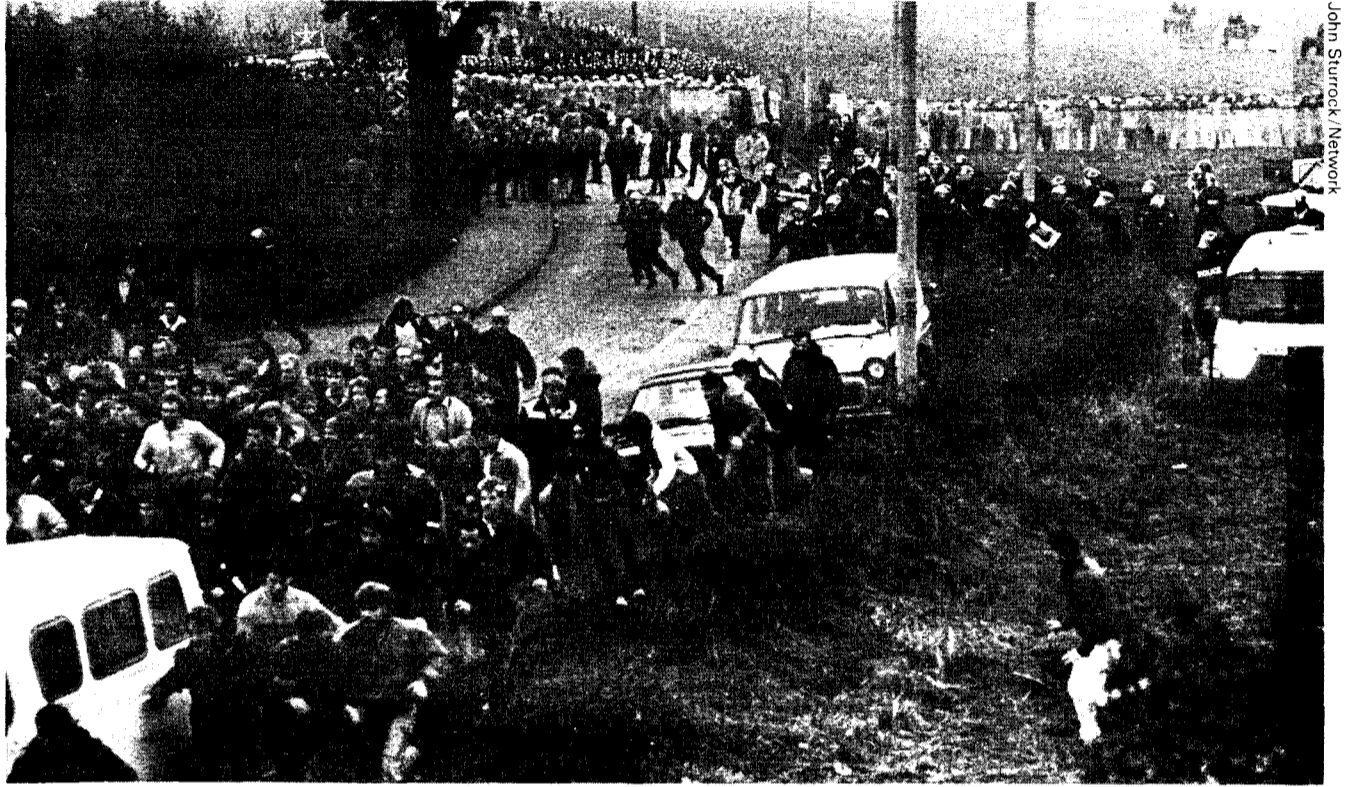
Police charge pickets at Brodsworth pit, Doncaster, 12 October. General strike to back the miners can break the strikebreakers!

have ensured that the miners are still alone on the picket lines, giving a green light to the government's sequestration moves and strikebreaking intransigence. There is today in Britain a profound crisis of leadership of the labour movement. While literally millions want to back the miners and beat the union-bashers, the reformist Labour/TUC leaders fear and hate the prospect of a serious class-wide confrontation with the capitalist state which poses the question: which class shall rule? Thus they are ready not only to let Thatcher off the hook but to isolate and sabotage the miners' struggle. Stop this treachery! The miners must not stand alone! Strike with the miners to win!