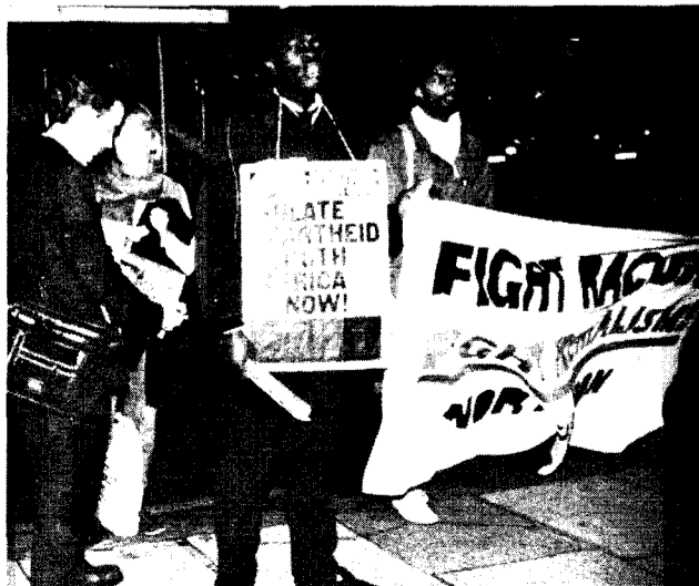
Picket outside South Africa House. Popular-frontist Anti-Apartheid Movement appeals to racist Thatcher government to 'isolate' her pal Botha.

The AAM reflects, albeit in a particularly rightist fashion, the political strategy of the African National Congress (ANC), the main organisation of black resistance to apartheid, and of its longtime bloc partner the South African CP. The ANC retains great moral authority among the toiling masses, many of its militants have heroically laid down their lives and its imprisoned leader Nelson Mandela is unquestionably the most revered black man in South Africa. But their struggle is thwarted and subverted by the ANC's strategy of seeking to court 'liberal' elements in the