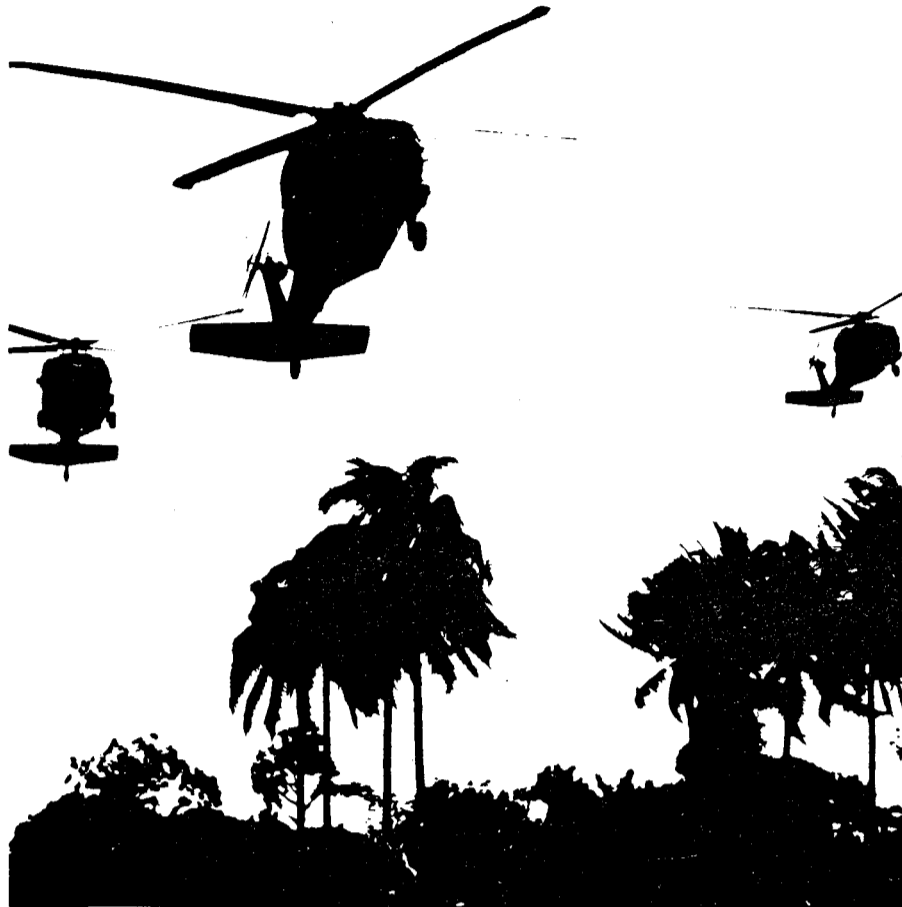
Vietnam? No, El Salvador. US helicopters ferry Pentagon chief Weinberger into embattled San Vicente province.

From the time Sandino rose up against the