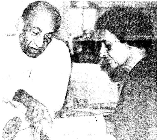
Indira Gandhi (right) with Lankan president J R Jayewardene, chauvinist anti-working-class butchers together.

Gandhi's funeral attracted an imposing assemblage of world leaders. Under her India has been an acknowledged leader of the so-called 'non-aligned movement' of neo-colonial countries, is a major sub-imperialist power in the region and a diplomatic ally of the Soviet Union. (Of course, as Sadat's Egypt demonstrated, capitalist allies of the Soviet Union are at best fickle.) It is one of the few capitalist countries not to fall into step with the vicious embargo against the Indo-Chinese workers states. It recognised the Heng Samrin government in Cambodia and in September was visited by Vietnamese leader Le Duan on his first visit to a capitalist country.