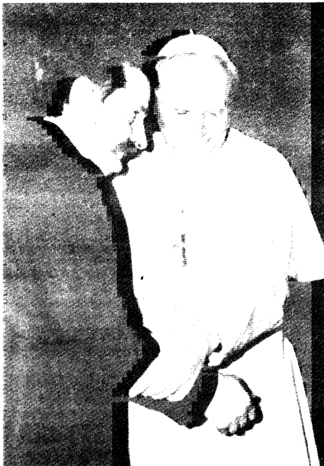
Pope-lover Walesa also embraces Thatcher's 'working miners', here seen getting a handout from the Iron Lady at Tory conference.