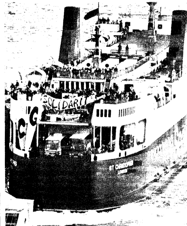
CGT ferry bearing French workers' contributions to British miners. Miners strike has inspired workers and oppressed around the world.

'The economic blind alley of the country which is most sharply expressed in the coal industry thrusts the working class on to the path of seeking a solution, that is on to the path of an even sharper struggle.'