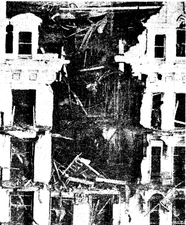
Brighton's Grand Hotel after IRA 'big bang'; reaction reveals how isolated and despised Thatcher clique is.

But the treacherous Kinnock, Willis & Co are doing everything in their power to kill the strike and save the Iron Lady. They engineered the eleventh-hour Nacods sellout, and wish they could do the same to the NUM. They