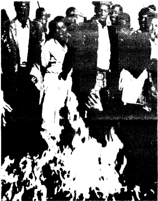
Defiant black South Africans burn the hated pass books, symbol of enslavement in their own land.

On the Black Consciousness movement, some years ago we wrote a major article, 'Behind South Africa's Black Consciousness Movement' [ Young Spartacus no 74, Summer 1979]. This movement originated as a split from the liberal National Union of South African Students, the big student movement of the late 1960s. It was predominantly English-speaking and white, but it had a black component. They would hold a conference in a room much like this, and everybody would rub shoulders together and say, 'Aren't we all one and equal?' Then they would go home, the whites to their plush hotel rooms,