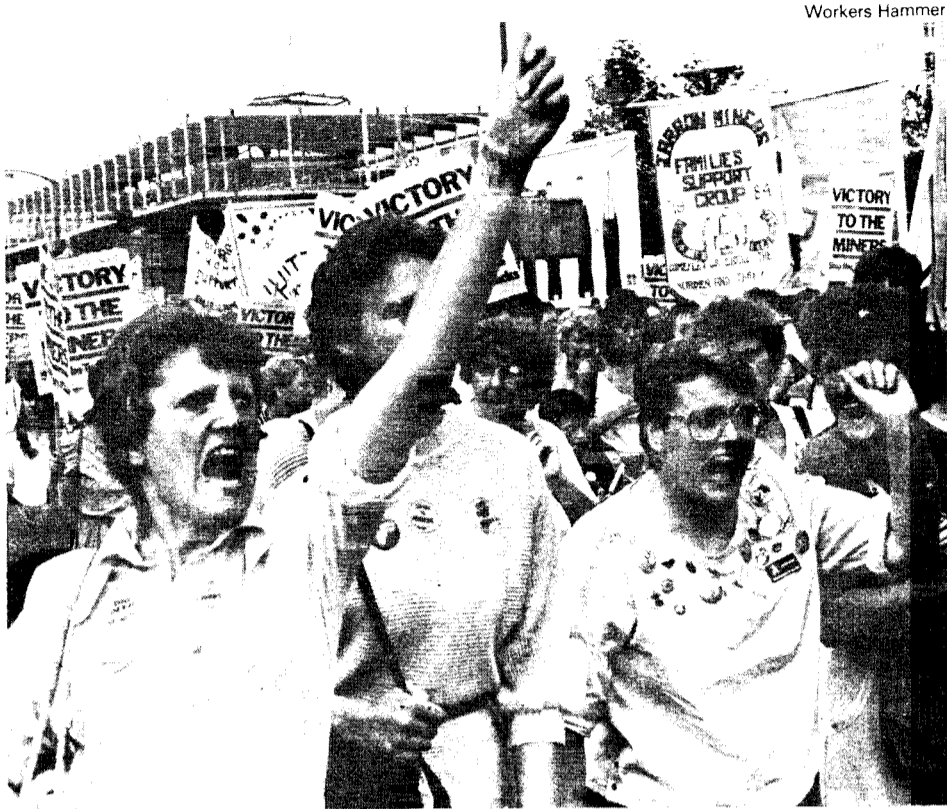
Militant women march through London, 11 August to support miners strike.

Our main objective is food for the kids. We wanted to have soup kitchens, but of course, we're in Staffordshire. They're working. We couldn't get any place to have a soup kitchen. So, we do food parcels. Our food parcels have been really good but, as you know, 29 weeks into a strike now, things get harder. Even a tin of -- when you talk about 400 tins of beans, it's damn hard to get 400 tins of beans every week. So, I mean, we're really struggling for the food. Another problem that we didn't see, when we started on the strike, was how many new babies we'd have. We've had quite a few new babies in the last few months. So, I mean, baby clothes and things like that are a dire need now. Then, of course, the biggest problem is facing us now. By the telly today, we've only got 74 days till Christmas. Well, you know what kids are like at Christmas time. So we're trying to appeal for toys now as well as food. How do you tell four and five year olds -- they believe in Father Christmas -- that he ain't coming this year cos your dad's on strike.