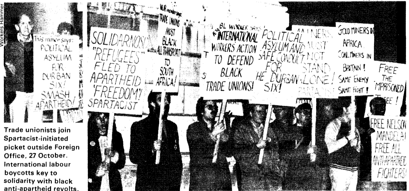
Trade unionists join Spartacist-initiated picket outside Foreign Office, 27 October. International labour boycotts key to solidarity with black anti-apartheid revolts.

Chanting 'Save the Durban Six -- Full asylum now!' and 'Trade unions take a side -- Stop all shipping, smash apartheid!', 65 protesters picketed the Foreign Office in the early evening of 27 October. The protest was called in solidarity with the revolt in South Africa and focussed on the plight of the six anti-apartheid activists who sought refuge in the British Consulate in Durban only to be threatened with expulsion by the Thatcher government. With three of these militants already in the hands of the apartheid murderers, Thatcher's Foreign Office openly expresses its desire to force out the remaining three. Among the placards were demands to 'Free the imprisoned three!' and 'Free all victims of apartheid terror!'