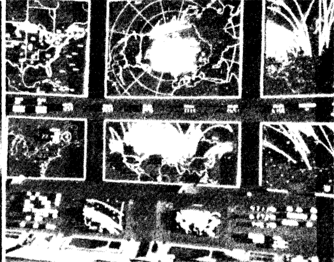
As Reagan prepares 'Star Wars' against Soviet Union, fake lefts embrace 'lesser evil' Mondale, certified Cold War hawk.