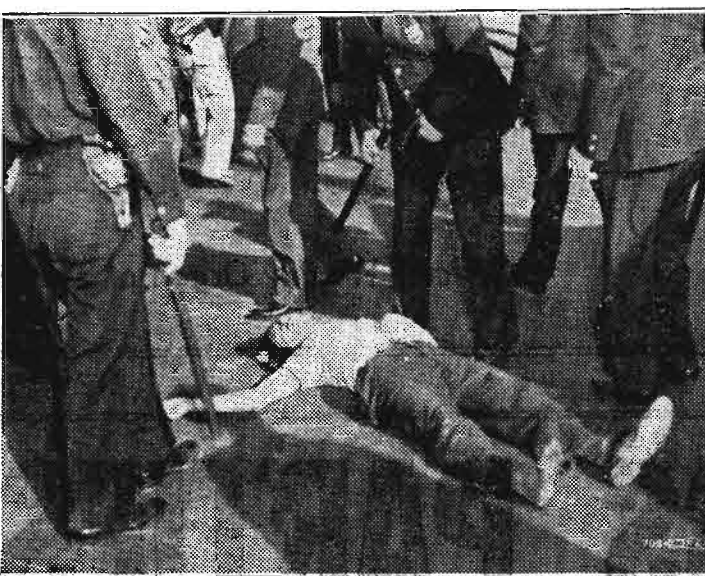
Preparing the war for democracy—New York cops ruthlessly clubbed pickets outside the Air King Radio Corporation plant in Brooklyn, N. Y., last week. The striker stretched out above was one of 13 injured in the attack by hundreds of policemen.