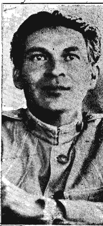
COL. FULGENCIO BATISTA