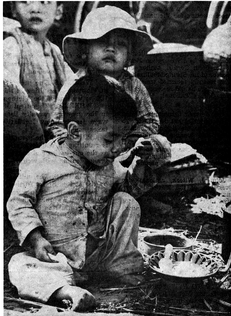
REFUGEE CHILDREN. Hundreds of thousands of south Vietnamese have been made homeless by U.S. attacks on villages.

What does it matter that I work from dawn far into the night trying to increase production so that we can distribute more chicks to the countryside when there is no way to assure the farmer of ade-