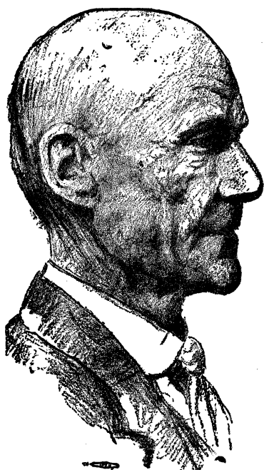
Eugene Victor Debs

American socialist movement by James P. Cannon.