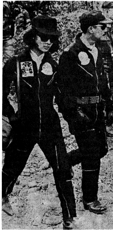
CAPTAIN MARVEL and wife. Dictator Ky's rule will not be disturbed by 'constitution.'

the constitution, the military congress exerted continual pressure on the assembly to come up with a document that would, in effect, simply legalize the continuance of military rule.