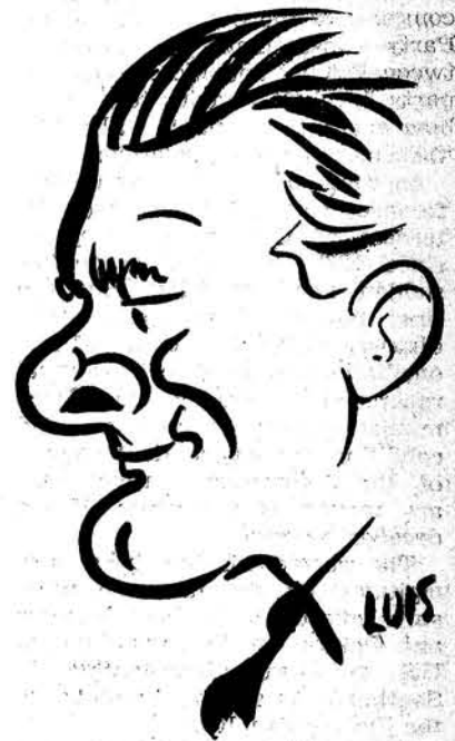
Henry Cabot Lodge