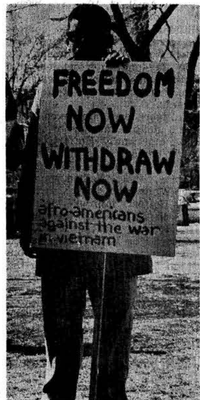
BOSTON DEMONSTRATOR. This picket was one of growing number of Afro-Americans participating in antiwar actions.

This reflects the fact that among those now being drawn into the antiwar movement there is no big preoccupation about possible embarrassment of the Democratic Party and pre-war liberals.