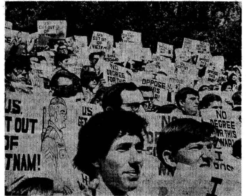
FLUNKED HIM OUT. University of California students at Berkeley at protest demonstration where they declared their opposition to honorary degree for pro-war UN Ambassador Arthur Goldberg.

But even before Goldberg rose to speak it was obvious that the thousands of protesters present at the Greek Theater were tired of hearing stale versions of the de-