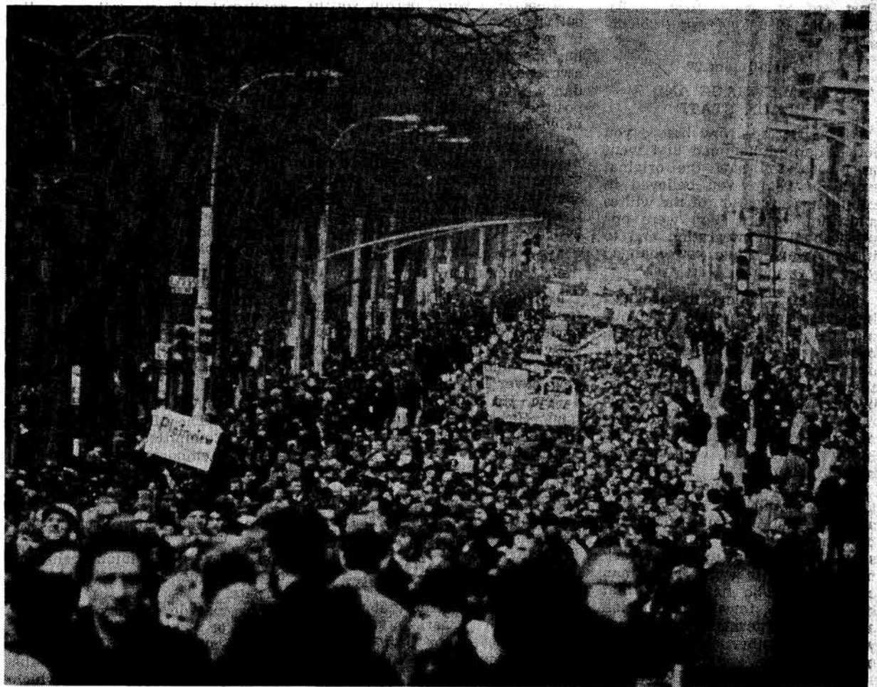
DOWN FIFTH AVENUE. Opponents of U.S. war in Vietnam marched down New York's Fifth Avenue for nearly three hours March 26. It was the biggest such wartime demonstration in the city's history.

Also gratifying was that the protest action coincided with the anti-government demonstrations in Hue and Saigon. It's a good omen.