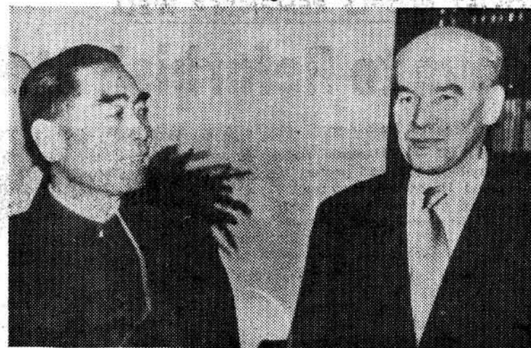
PRIOR TO SPLIT. Chinese leader Chou En-lai with Polish Premier Gomulka prior to rupture in Soviet-bloc countries.

While Peking and Moscow pointed accusing fingers at each other for responsibility in a situation that is seriously weakening both of them in the world relation of forces, Washington has busied itself in scheming how to take further advantage of the deepening