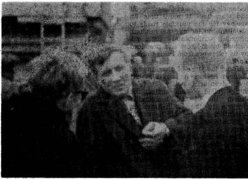
POET OF PROTEST. Soviet poet Yevgeny Yevtushenko interviewed by newsmen at Helsinki Youth Festival in 1963.

gued that the Soviet people would "never understand or accept any deviation, even in part, from the condemnation of Stalin's personality cult in 1956" and that they knew of no "arguments which can make us believe that anything in this condemnation was unjustified." They also warned that any rehabilitation of Stalin would lead to a "new split in the ranks of Communists, between our party and the Communist parties of the West."