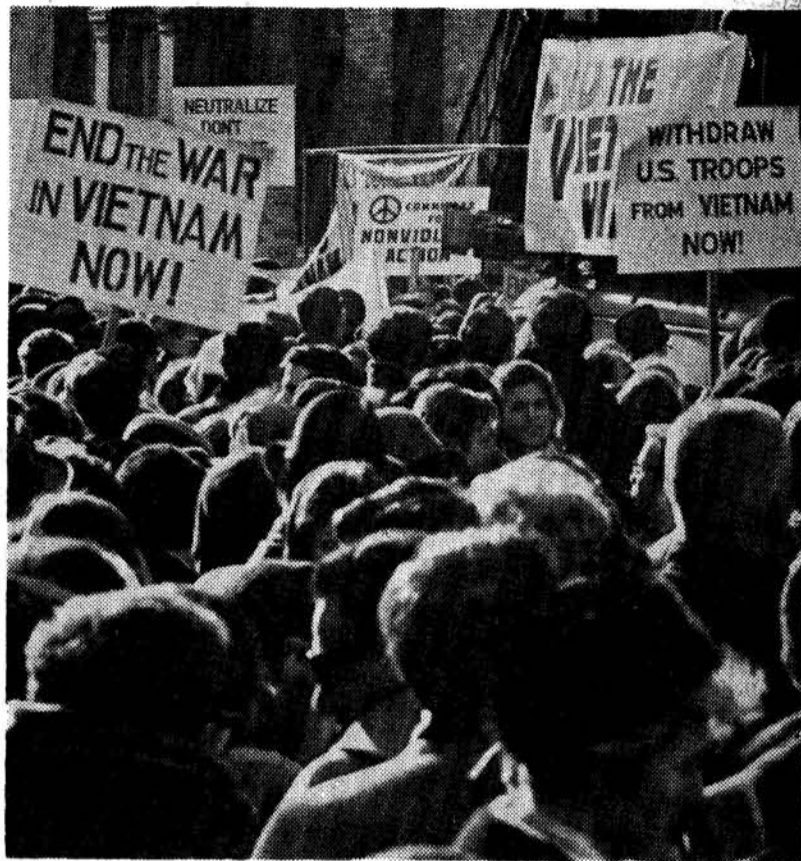
AGAINST WAR. A student demonstration in New York's Washington Square protesting U.S. intervention in Vietnam. Such demonstrations throughout the country will be climaxed by national student demonstration in Washington April 17. See story page 8.

The independent British Sun on March 25 expressed the general mood: "Every day news from Vietnam is about American air raids, about tear gas, about napalm, and about still more hideous