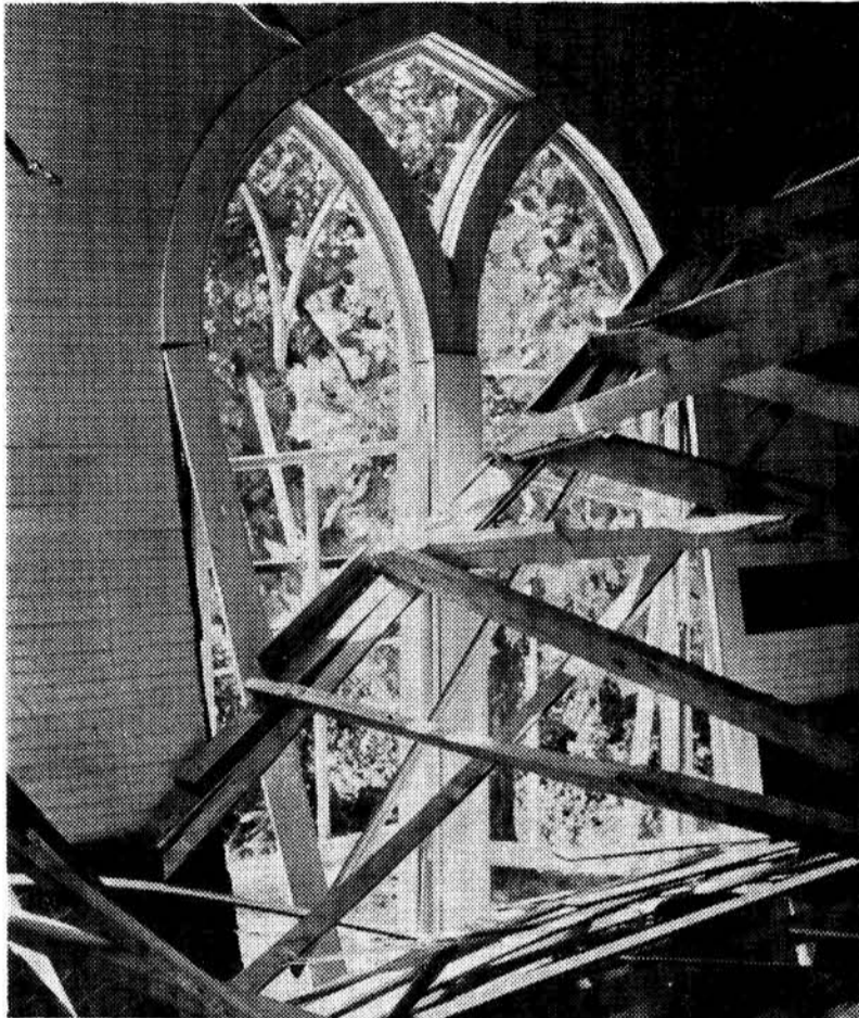
RACIST HANDIWORK. A bombed-out Negro church in McComb, Miss. Several dozen such real or suspected centers of civil-rights activity have been destroyed in Deep South in past year.

Because of the early discovery, the fire was limited to the front section of the building. It did, however, damage the wiring. Because it is hard to get a licensed plumber or electrician to do work for anything connected with civil rights and because the city inspectors stalled on every point, the building could not be used for six weeks. Outside meetings were held when weather permitted. The first outside meeting was broken up by cops.